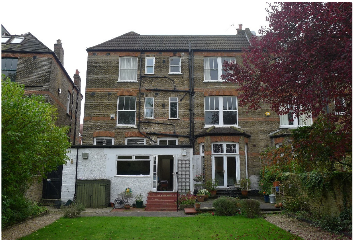
Rear elevation from the garden DVM Architects Ltd 30.08.17