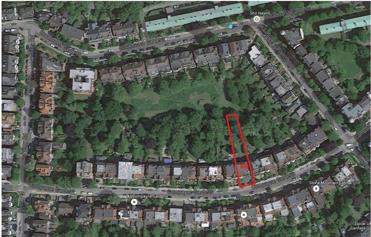
Aerial view of site location