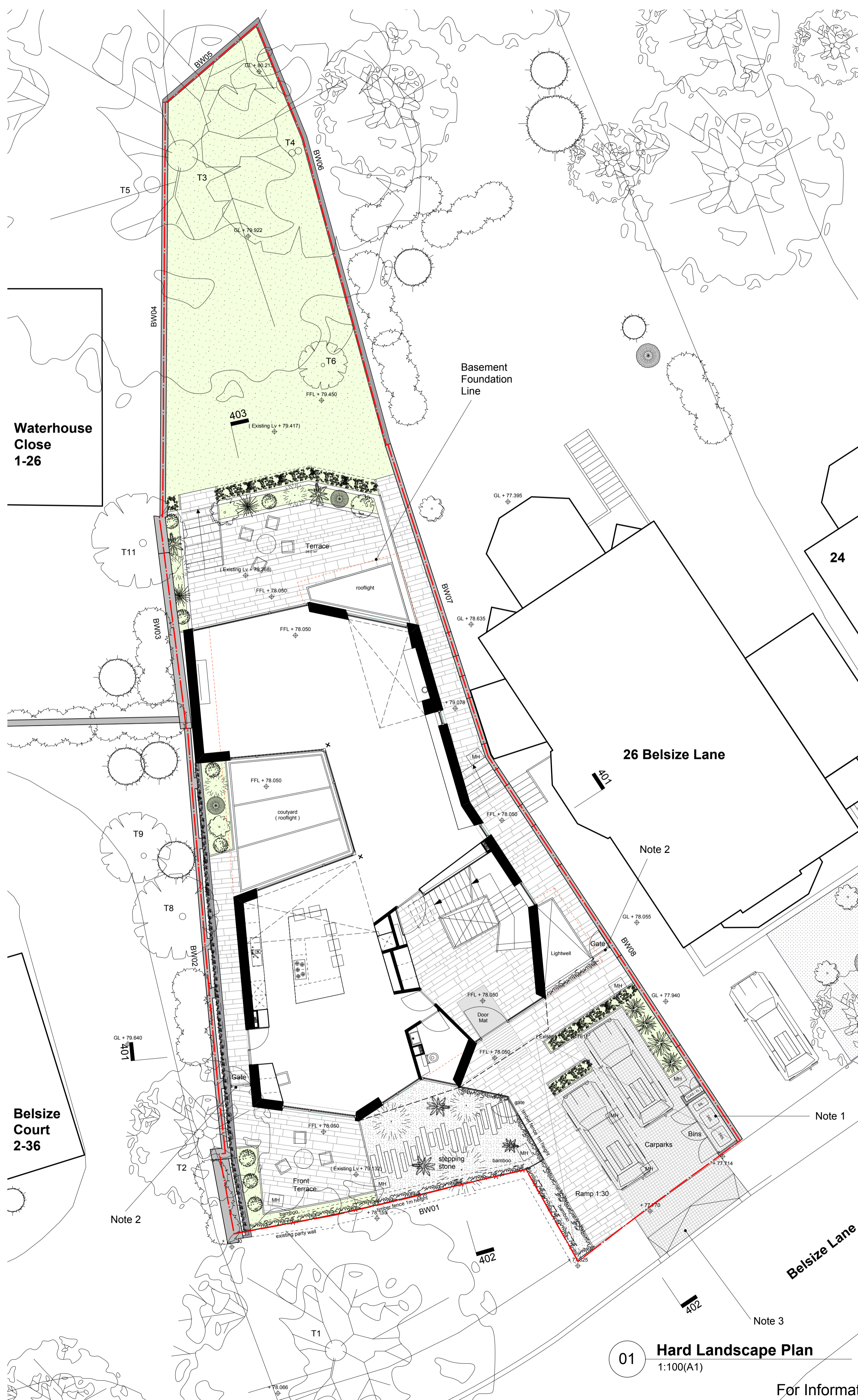
01 Hard Landscape Plan 1:100(A1)