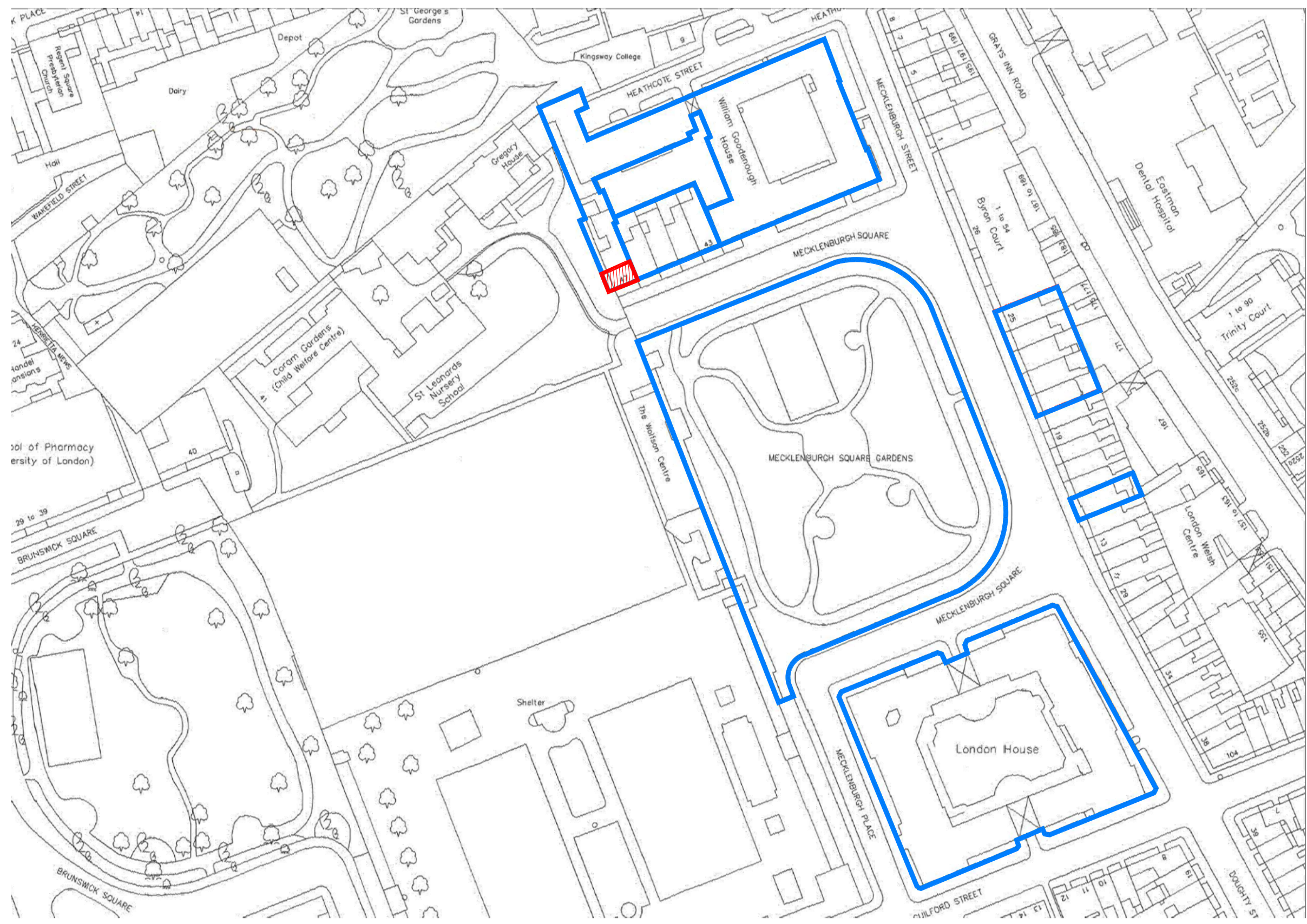
Site Location Plan Scale 1:1250 @ A3