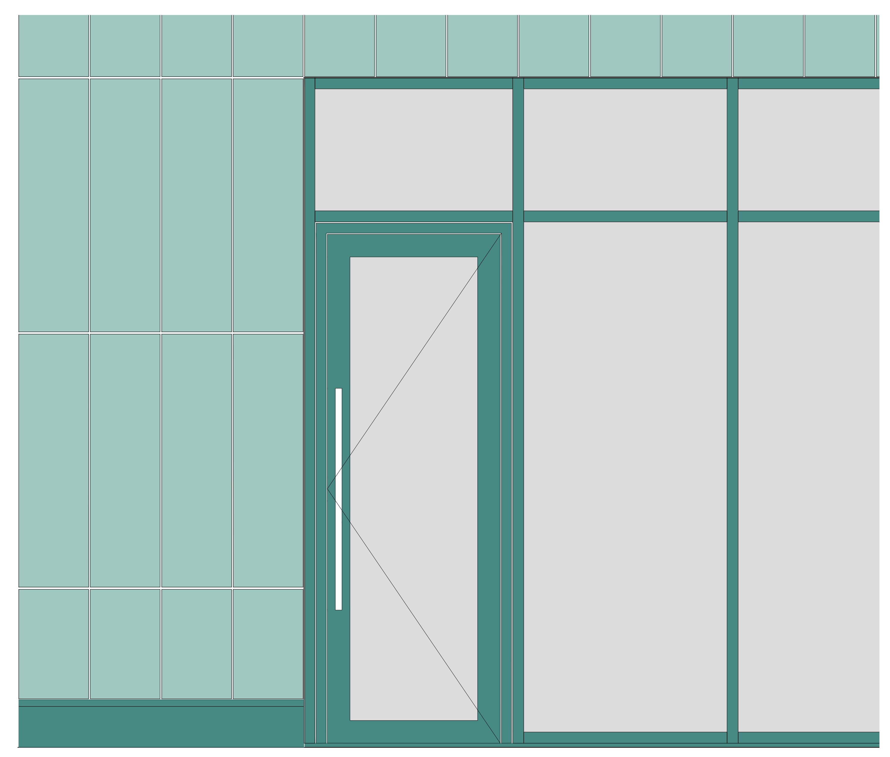
02 CURTAIN WALLING - GROUND Elevation 1:10