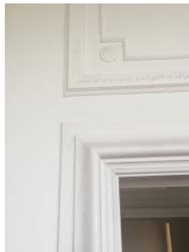
Original plaster moulding panels to walls in Dining Room (4101)