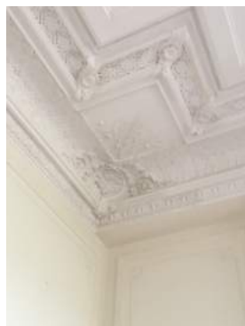
Cornice detail to Dining Room (4101) and Bedroom 1 (4109) Original fibrous plaster cornice with 4 elements; twin ogee and anthemion motif to ceiling, scotia and torus roll, finely decorated cavetto of interlocking flower and leaf pattern with torus roll and egg and dart to wall