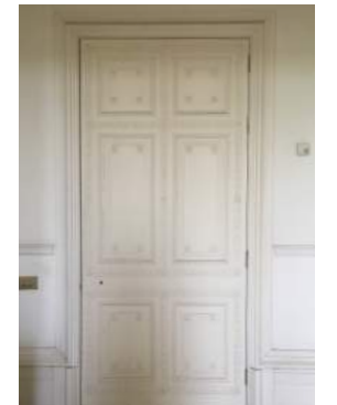
Original door FD03 - six panels with margins