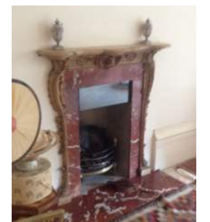
Timber moulding to opening, square jambs, brackets to shelf with central urn on frieze (Original) Cast iron pattern insert and slate hearth

Existing First Floor Plan 1:100 @ A3 Room names as per planning consent - HB/959570162 Dated - August 1995