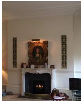
Non original fire place to Reception Room (5101)