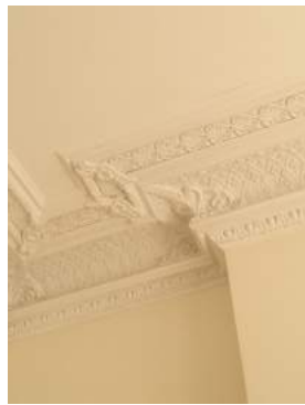
Reception Room (5101) Non original fibrous plaster cornice with combination of 3 elements; twin astragals to ceiling separating scotia to double ogee and finally minor ogee to wall