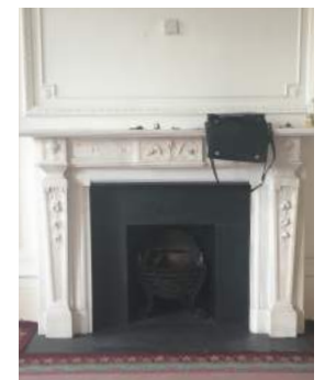
Original - White marble square jambs redded corners with pilasters of exaggerated entasis and garland. Urn at top of pilaster. Frieze carving with 2 birds. New shelf. Black slate insert with heart.