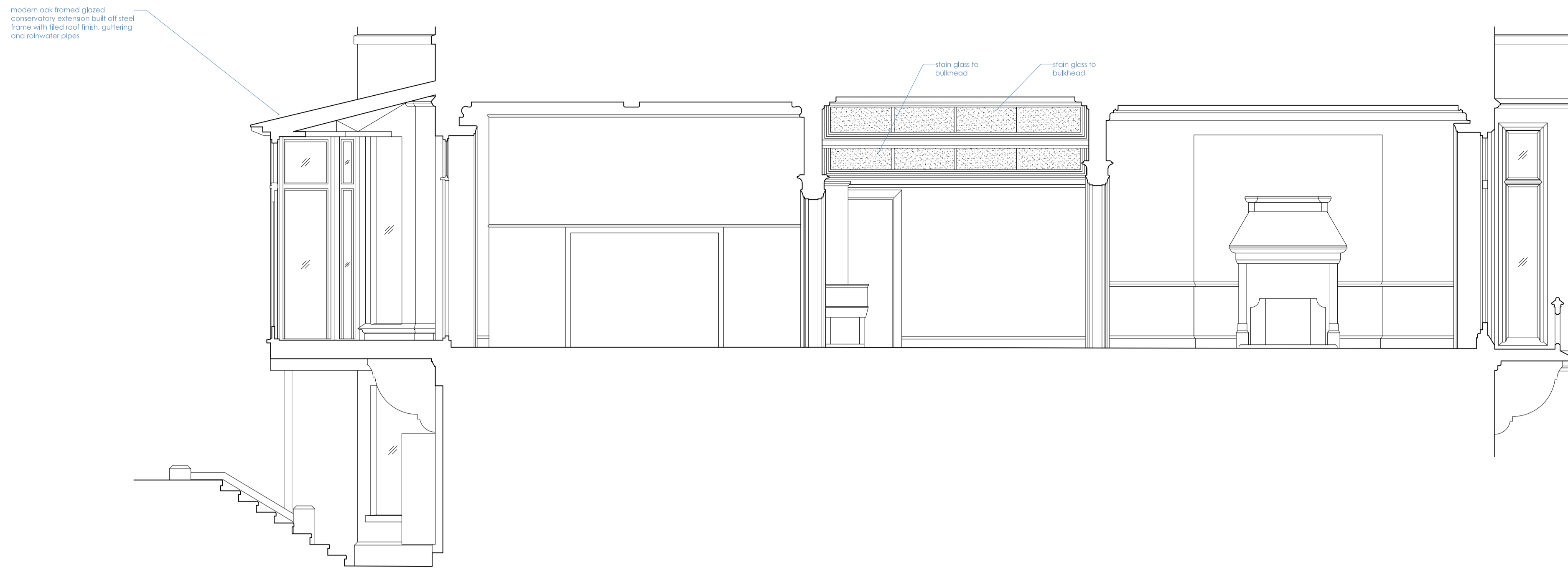
1 Existing Section A-A Scale: 1:50 @ A1 & 1:100 @ A3