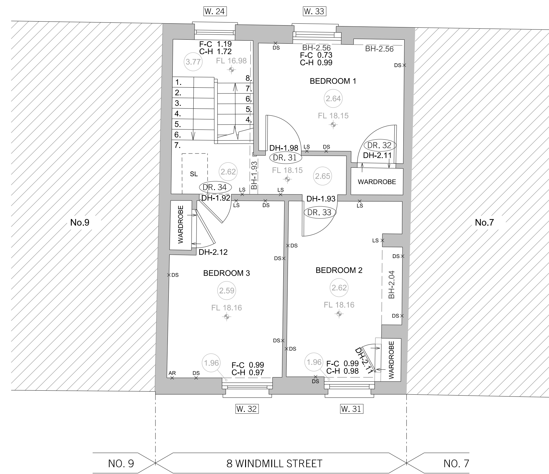
02: EXISTING THIRD FLOOR PLAN SCALE 1:50