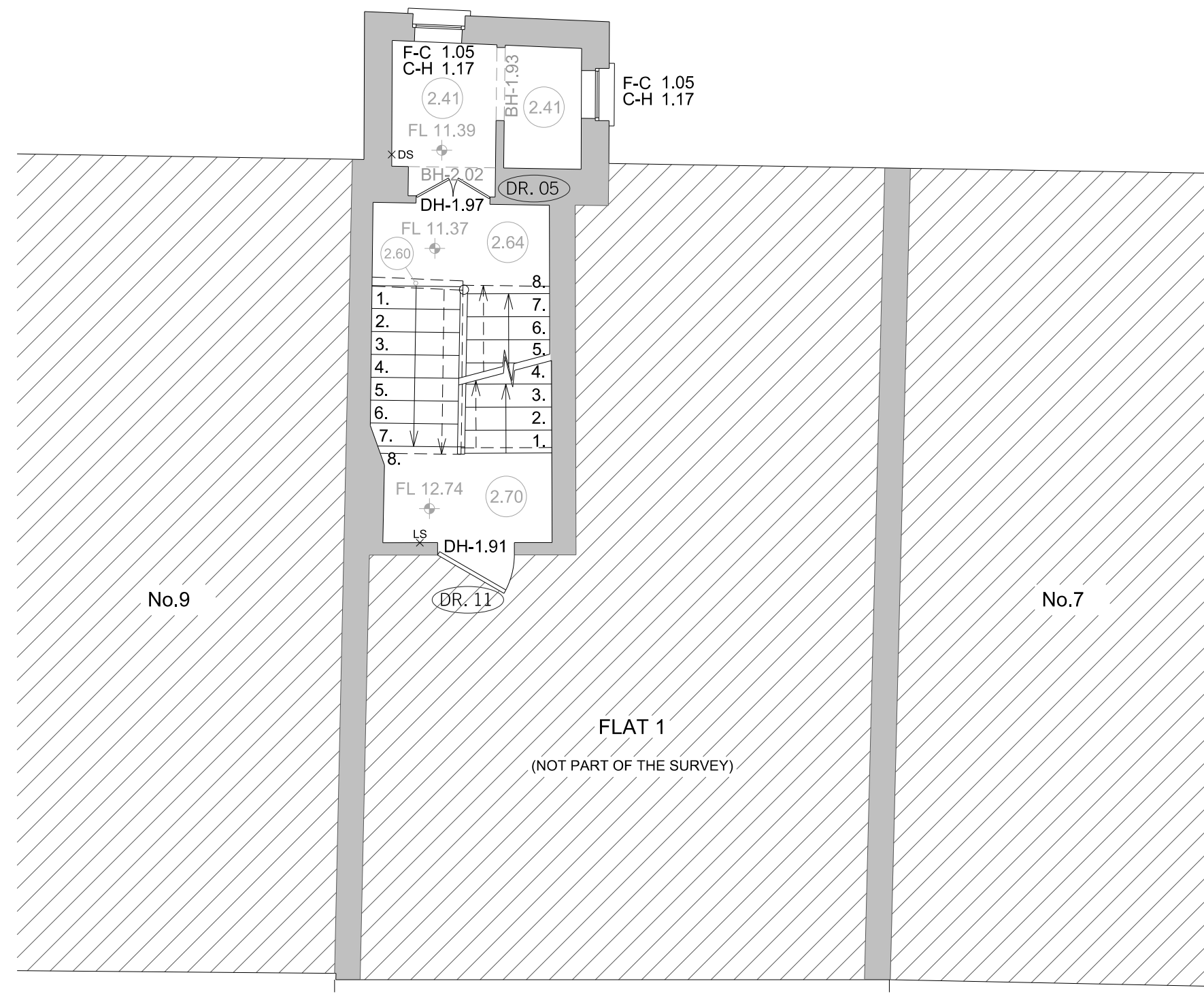
02: EXISTING FIRST FLOOR PLAN SCALE 1:50