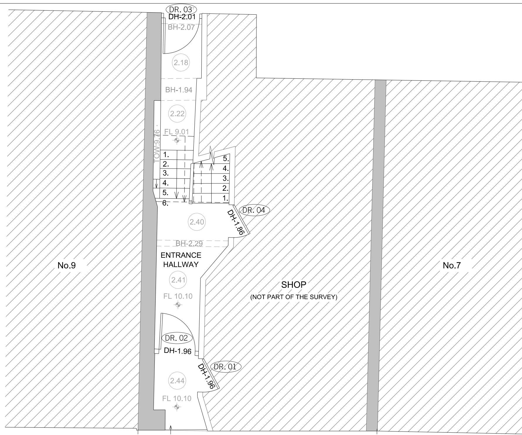
01: EXISTING GROUND FLOOR PLAN SCALE 1:50