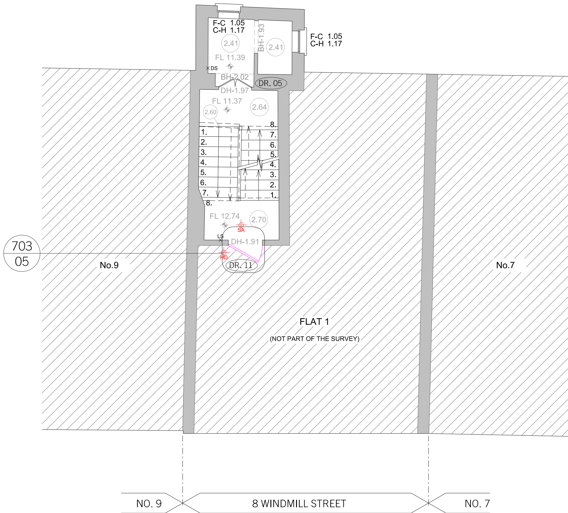
04: PROPOSED FIRST FLOOR PLAN SCALE 1:50