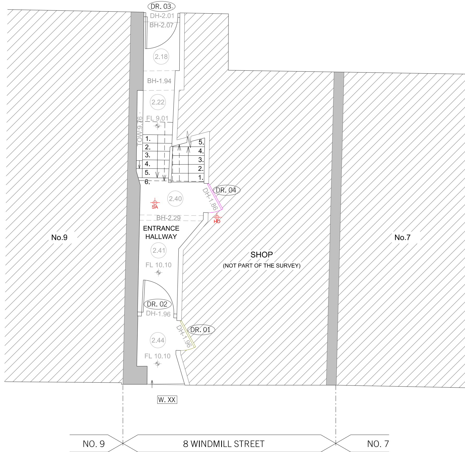
03: PROPOSED GROUND FLOOR PLAN SCALE 1:50