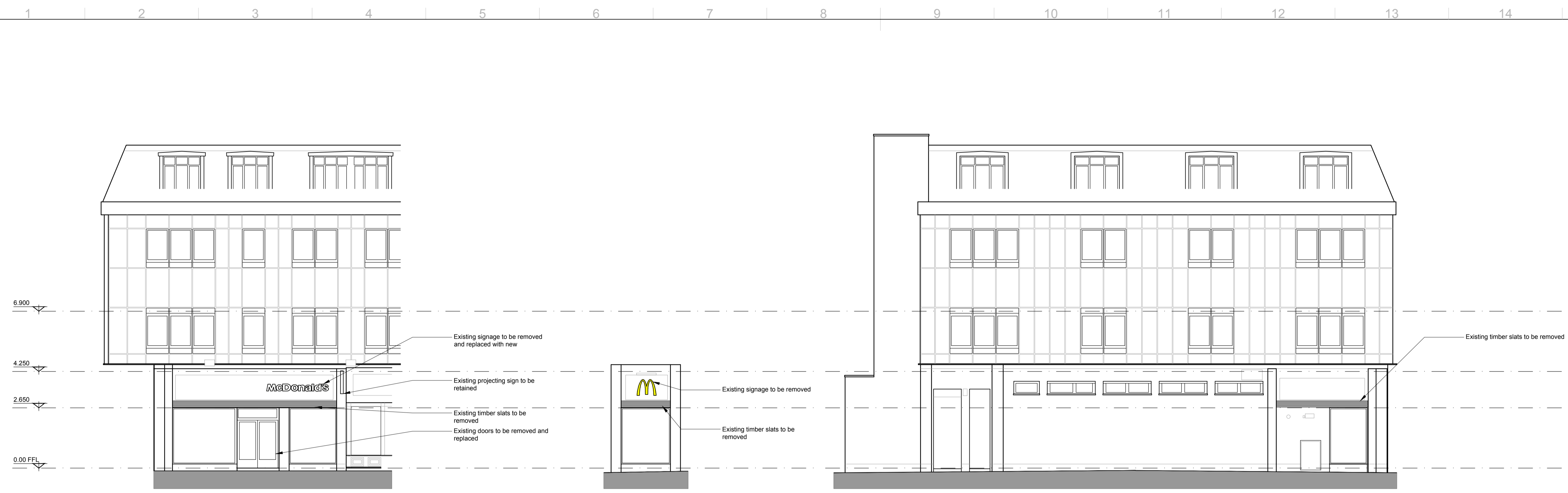
Existing Elevation A Scale 1:50