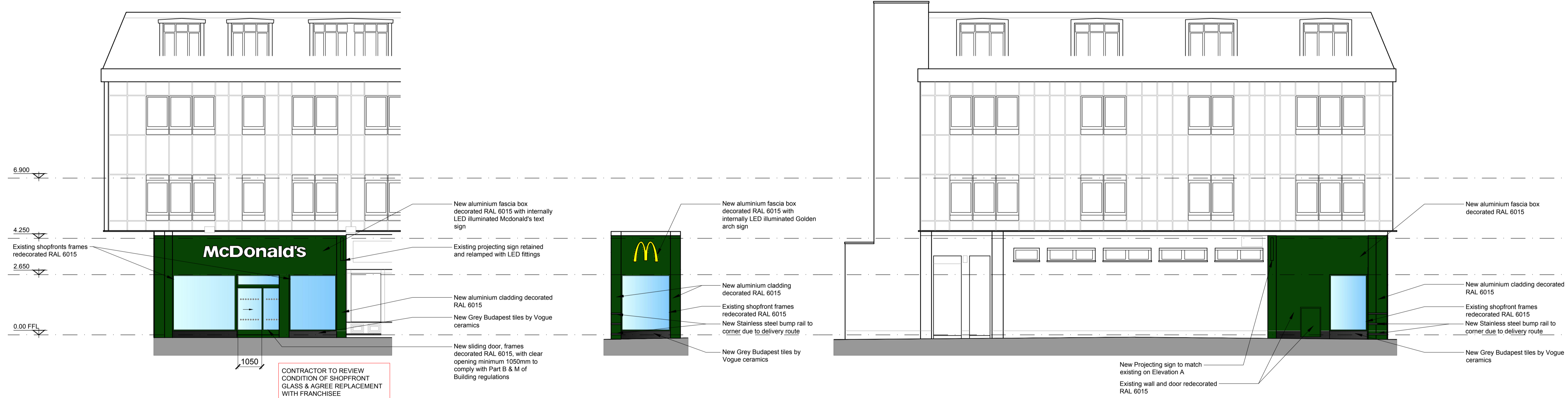
Proposed Elevation A Scale 1:50