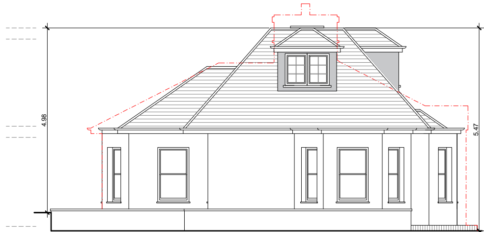
GRANTED NORTH SIDE ELEVATION