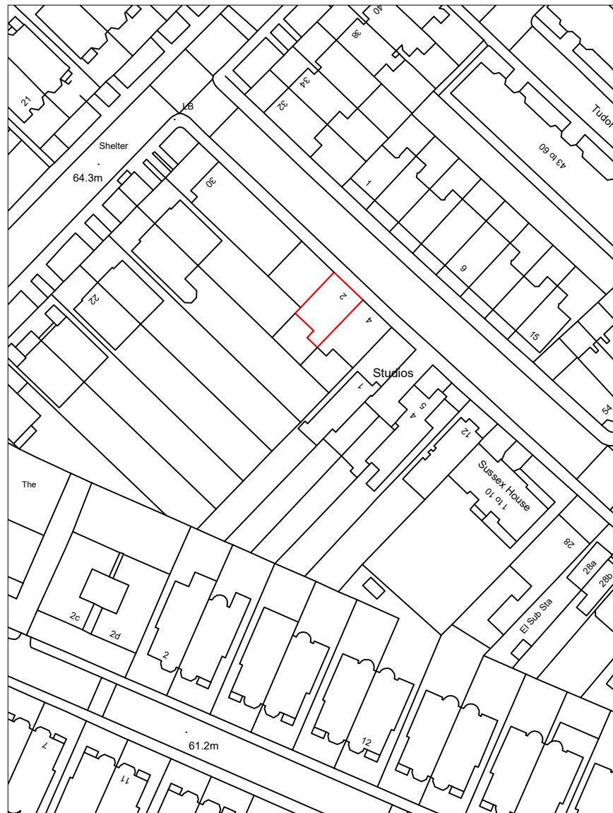
Site Plan - Scale: 1:1250