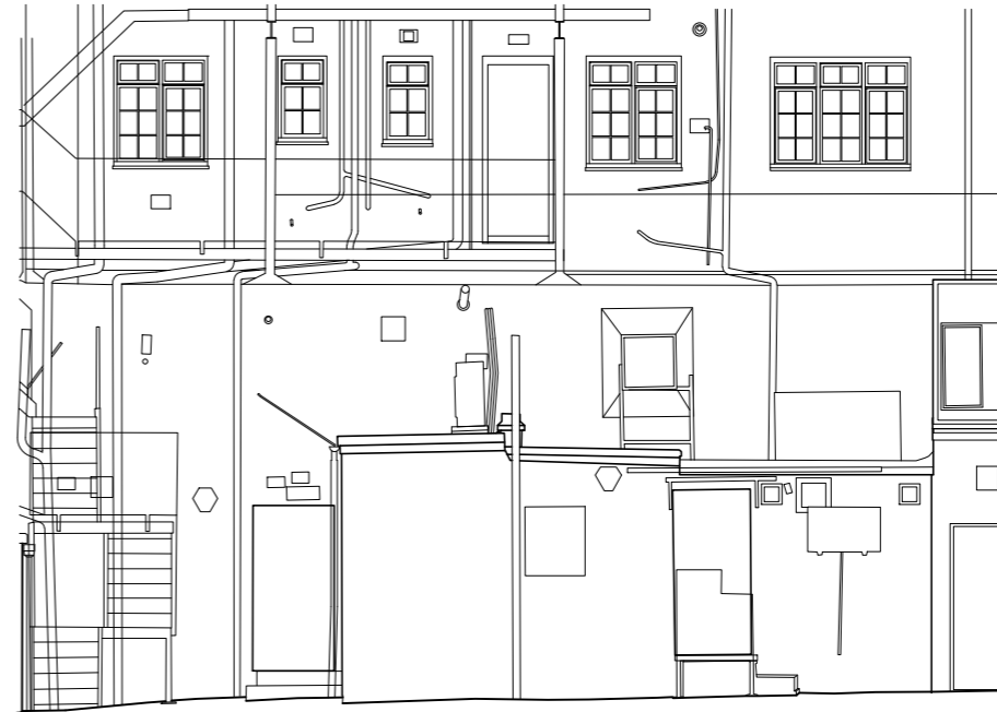
02 EXISTING REAR ELEVATION SCALE 1:50@A1