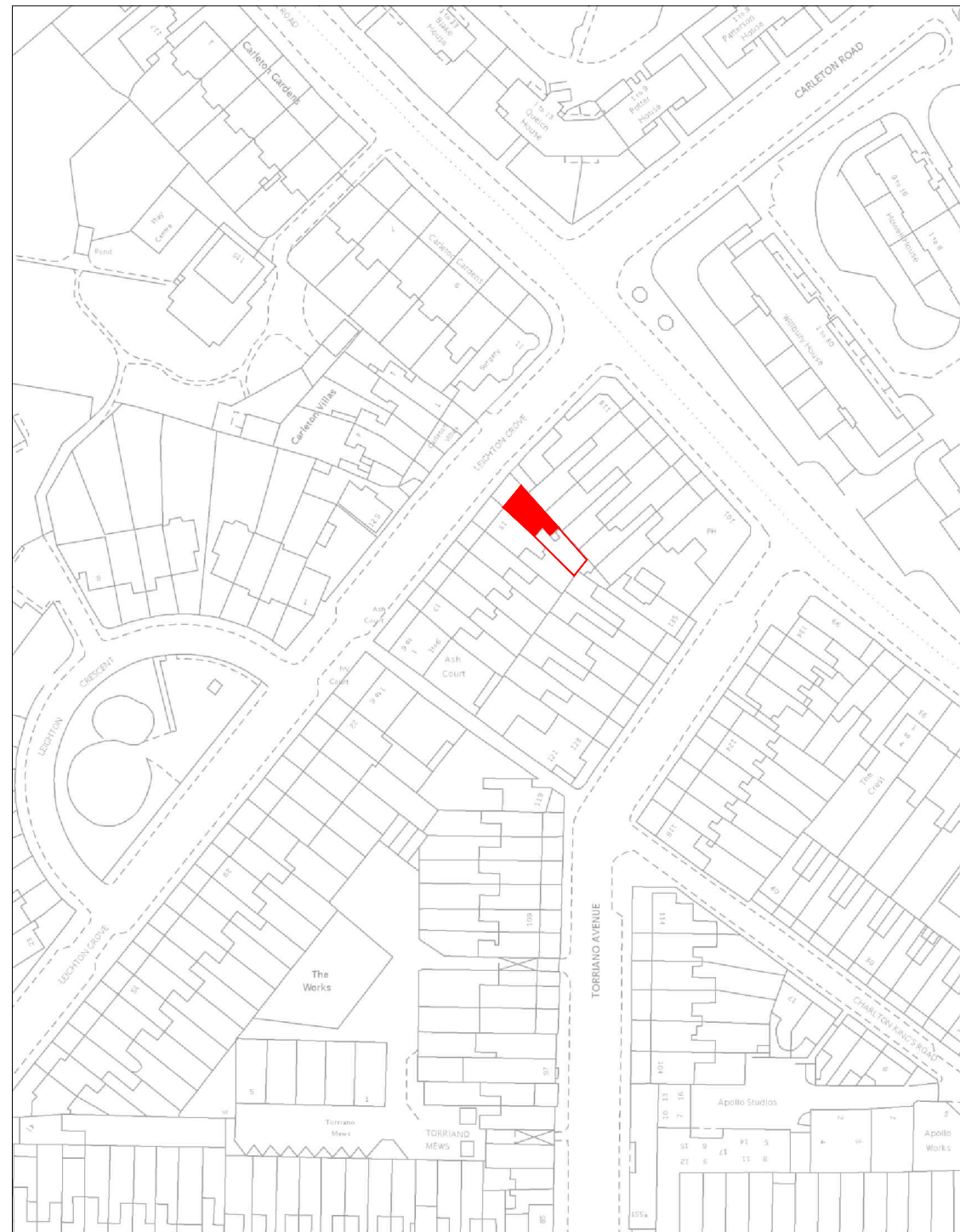
Site Location 1:1250

This drawing is not to be scaled. Use figured dimensions only. All dimensions are to be checked on site and any discrepancies, errors or omissions are to be reported to the architect prior to commencement of works.