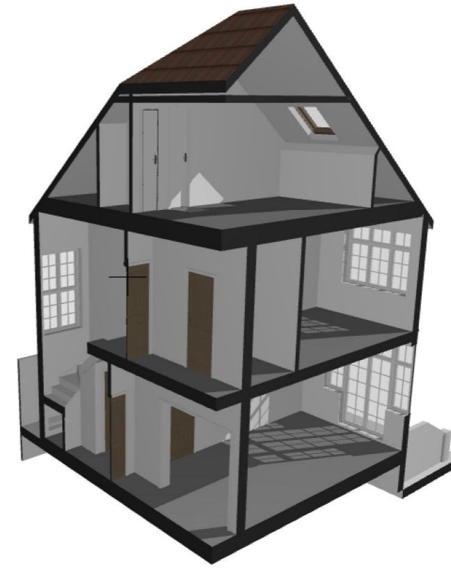
SECTION 3D VIEW