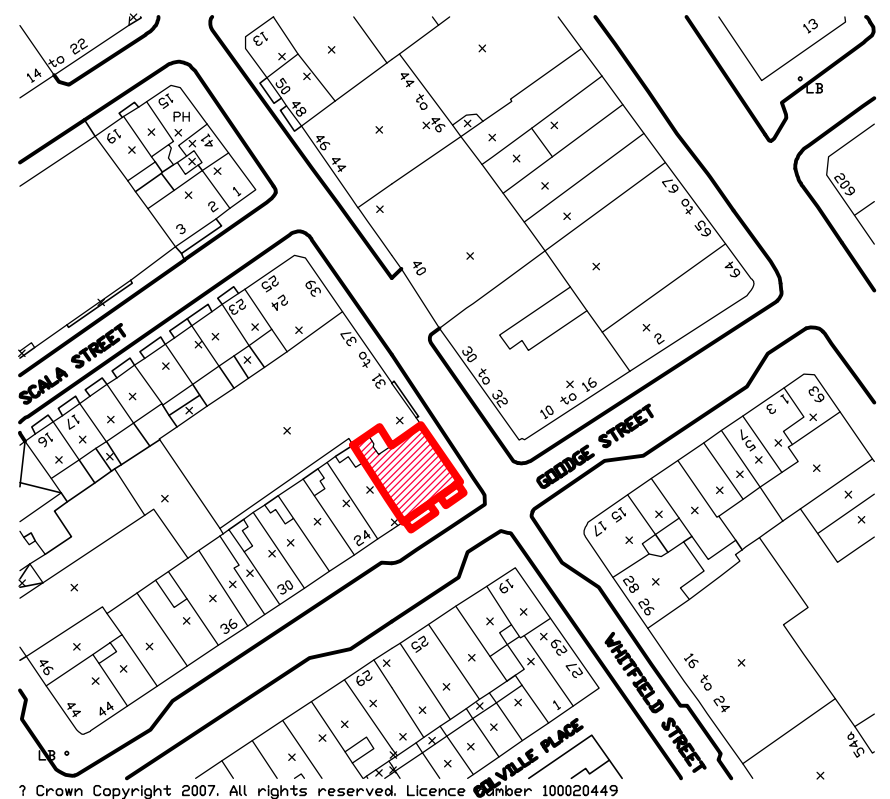
Site Location Plan (1:1250)