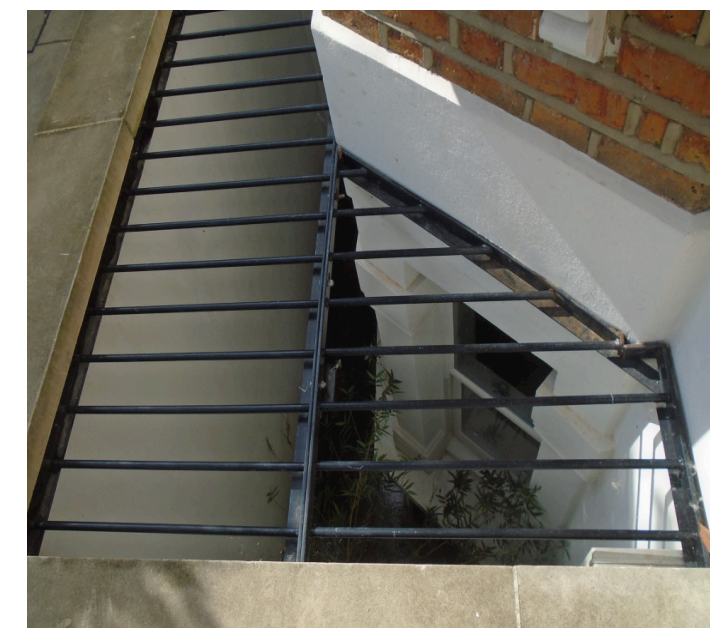
Front Patio existing grill @ n. 57 Solent Road ( next door property)