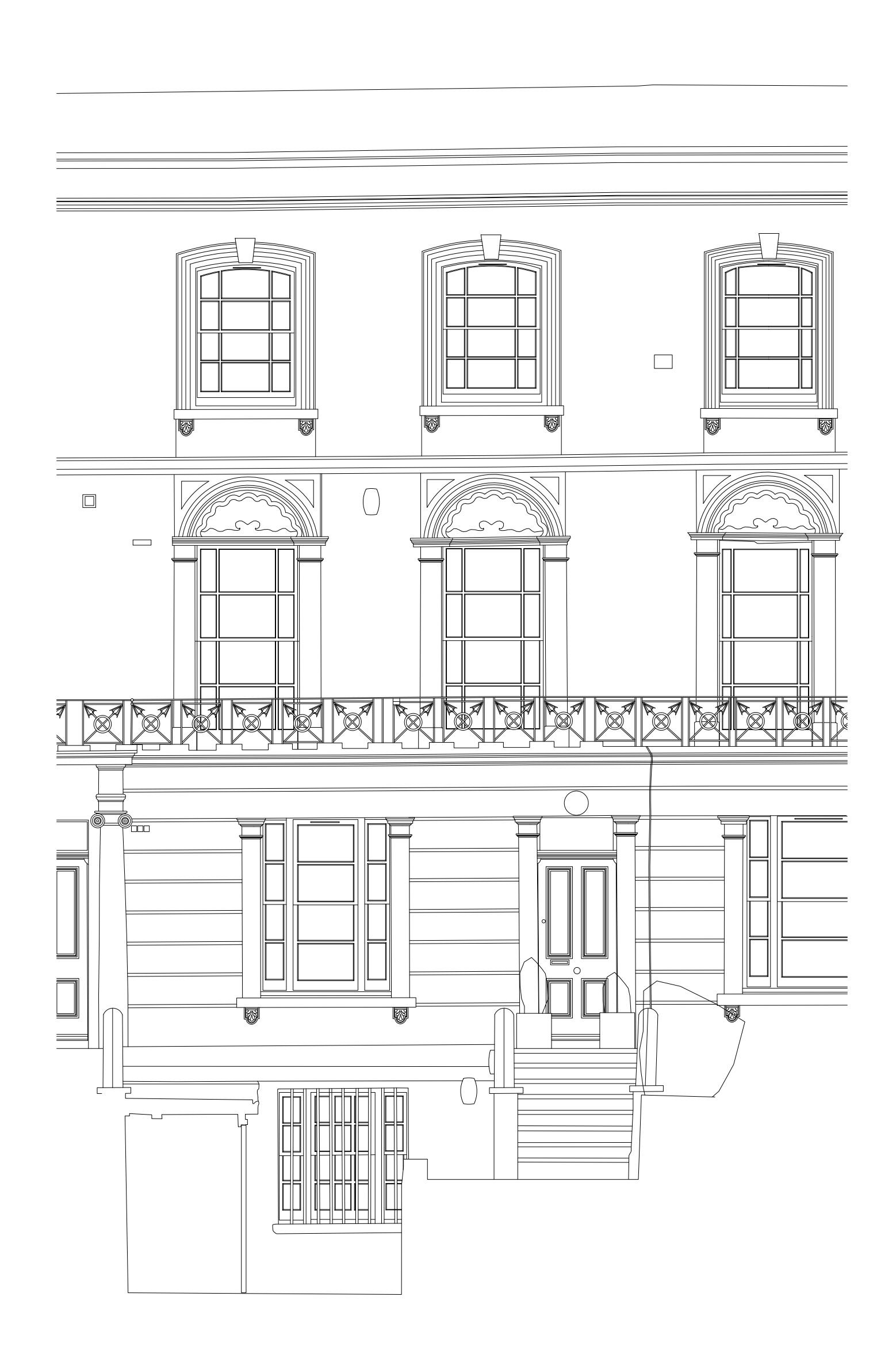
Existing Front Elevation 1:50 @A1