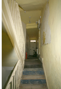
View 8.- Stairs.