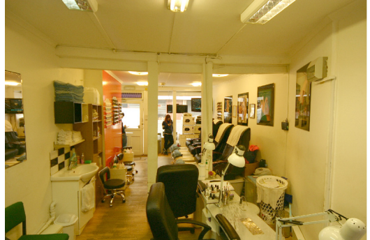
View 7.- Commercial unit.