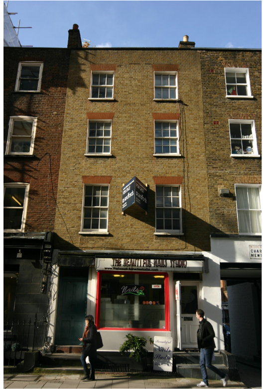
View 12.- FRONT FACADE.