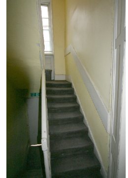
View 9.- Stairs.