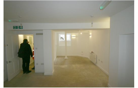
View 1.- Basement.