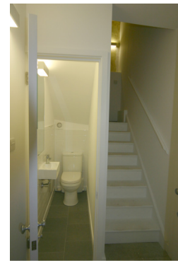
View 2.- Toilet.