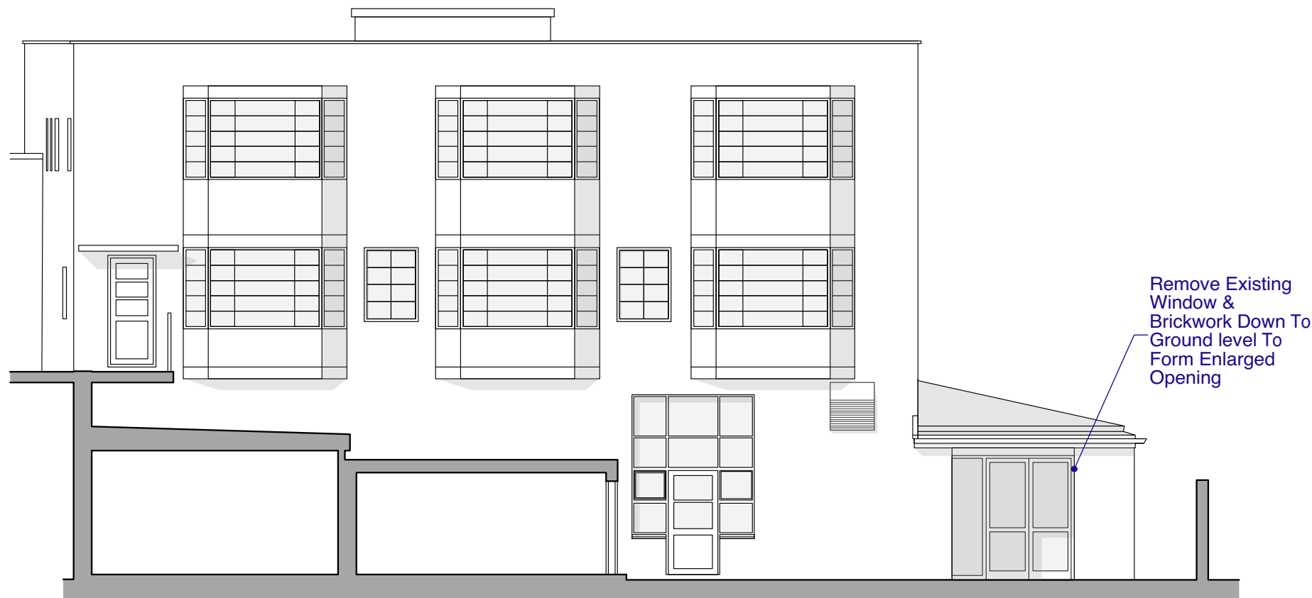
Rear Elevation (South)

New Widened Entrance Opening With Glazed Metal Doors Opening Outwards