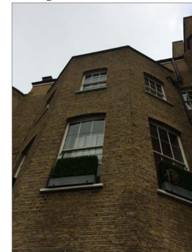
Existing windows of Front facade