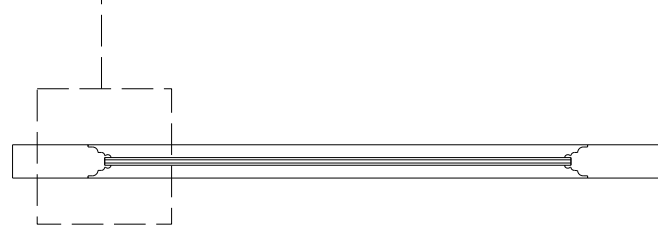
PROPOSED DOOR ELEVATION - Scale 1 : 10

To be read in conjunction with approved drawing 'Proposed Lower Ground Plan 074.301'