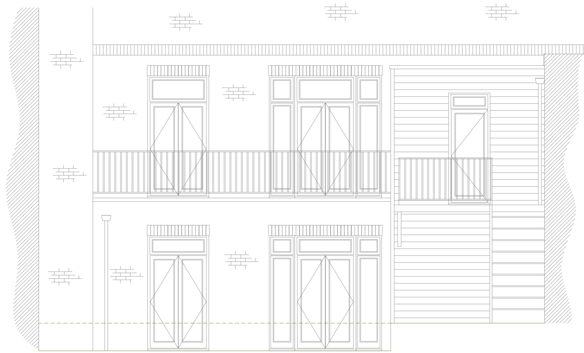
EXISTING REAR ELEVATION Scale 1:50