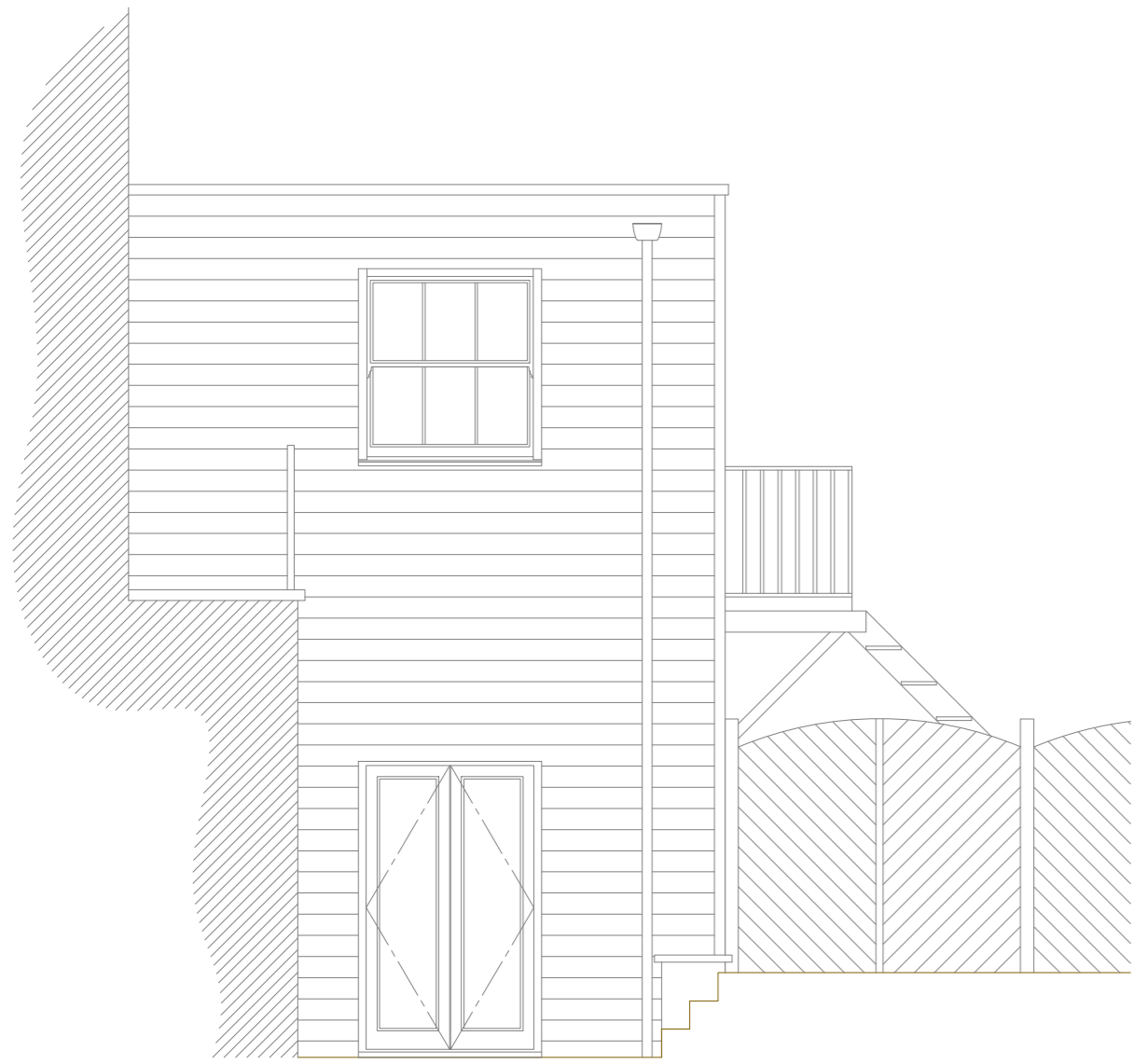
EXISTING SIDE/SECTION ELEVATION Scale 1:50