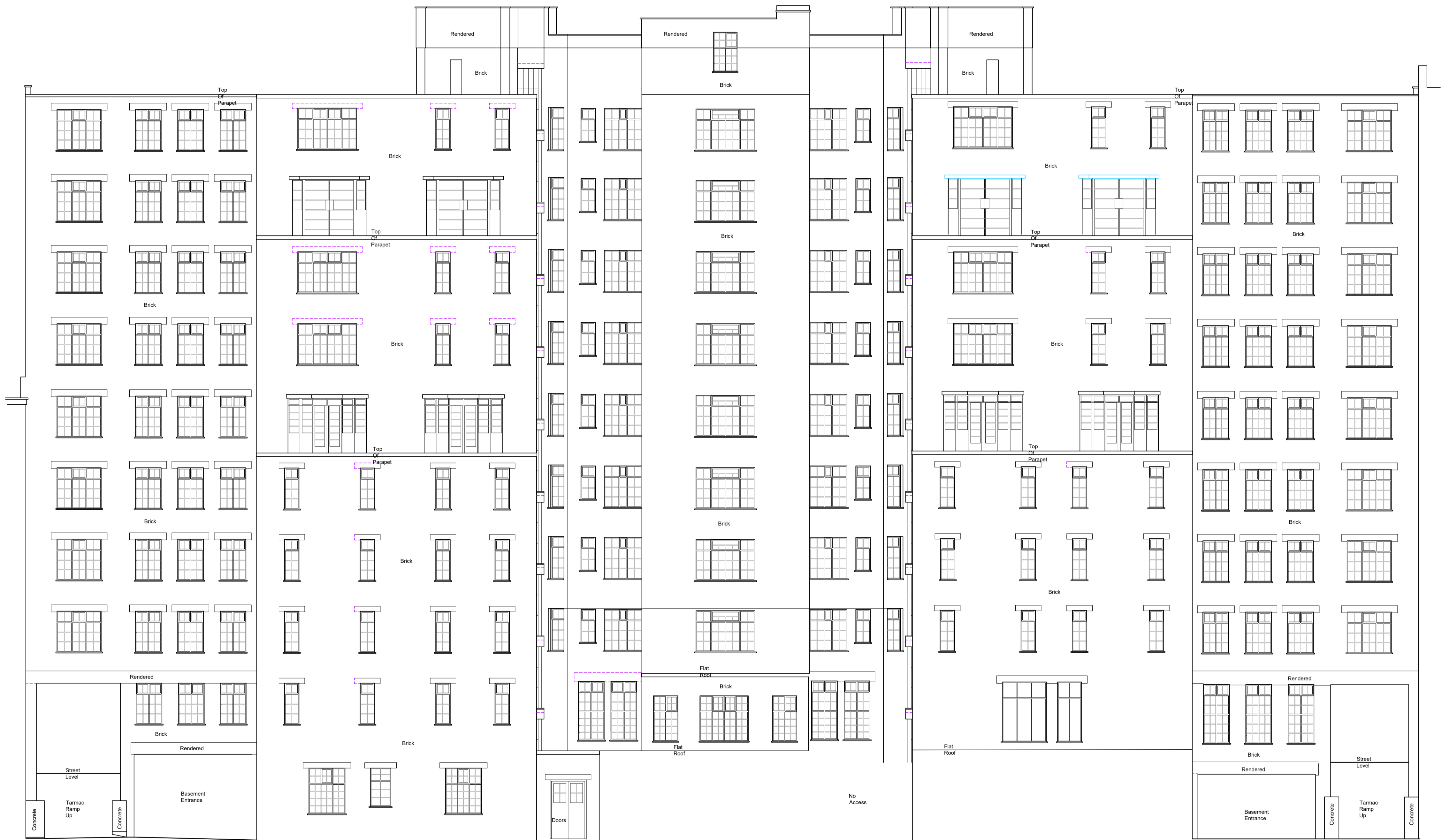
Rear Elevation B scale 1:100

Replacement windows to be Duration Windows from their Heritage Putty-line range, finished in white