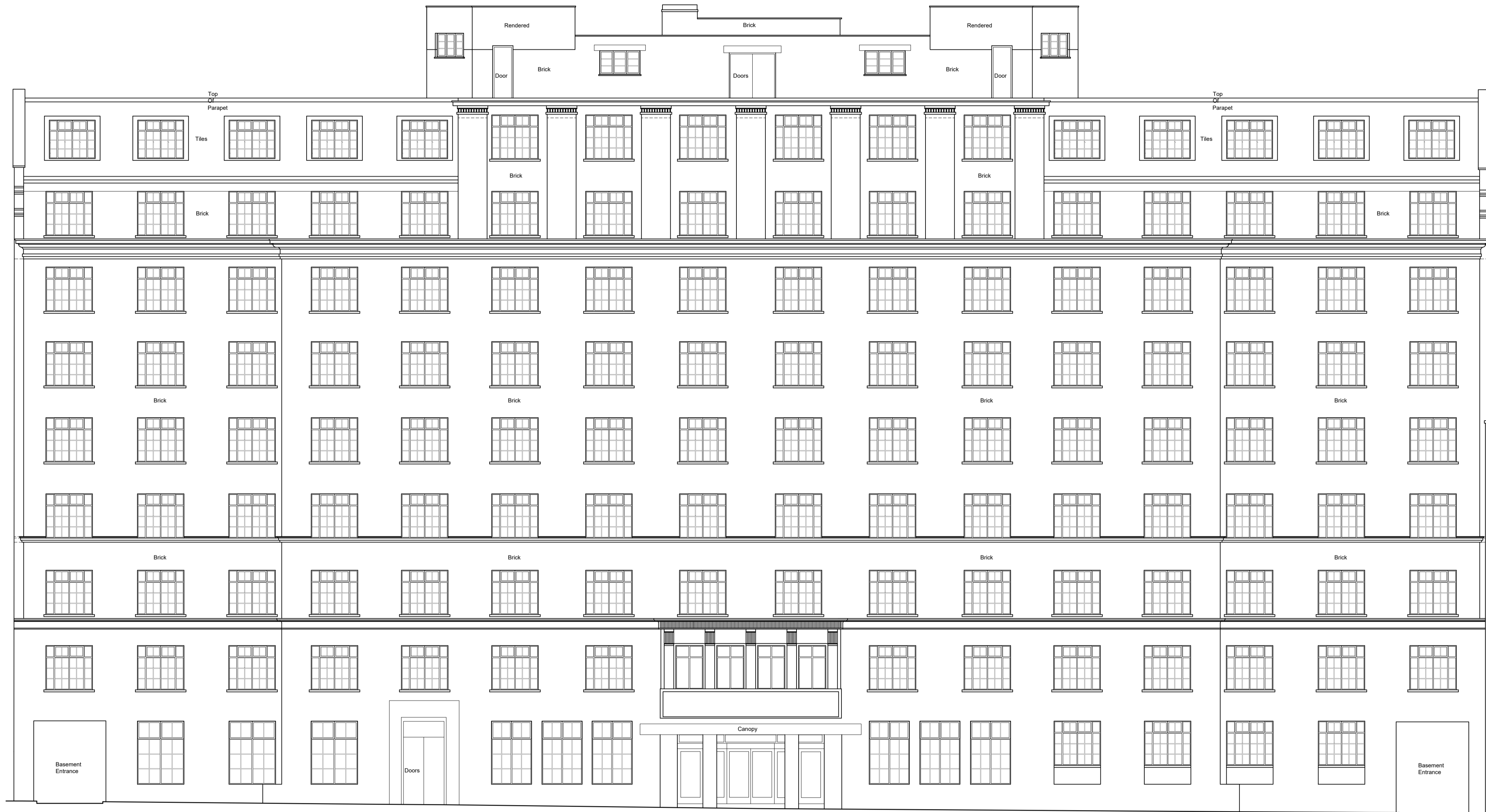
Front Elevation A scale 1:100

Verify all dimensions on site before commencing any work or preparing any shop drawings. All dimensions are in mm unless otherwise stated. Report any alterations or omissions to the Architect. This drawing incorporates information from other professions. Maylands Consulting cannot accept responsibility for the integrity or accuracy of such information. Any clarification and/or additions that are required appertaining to such information should be sought from the relevant party or their appointed representative.