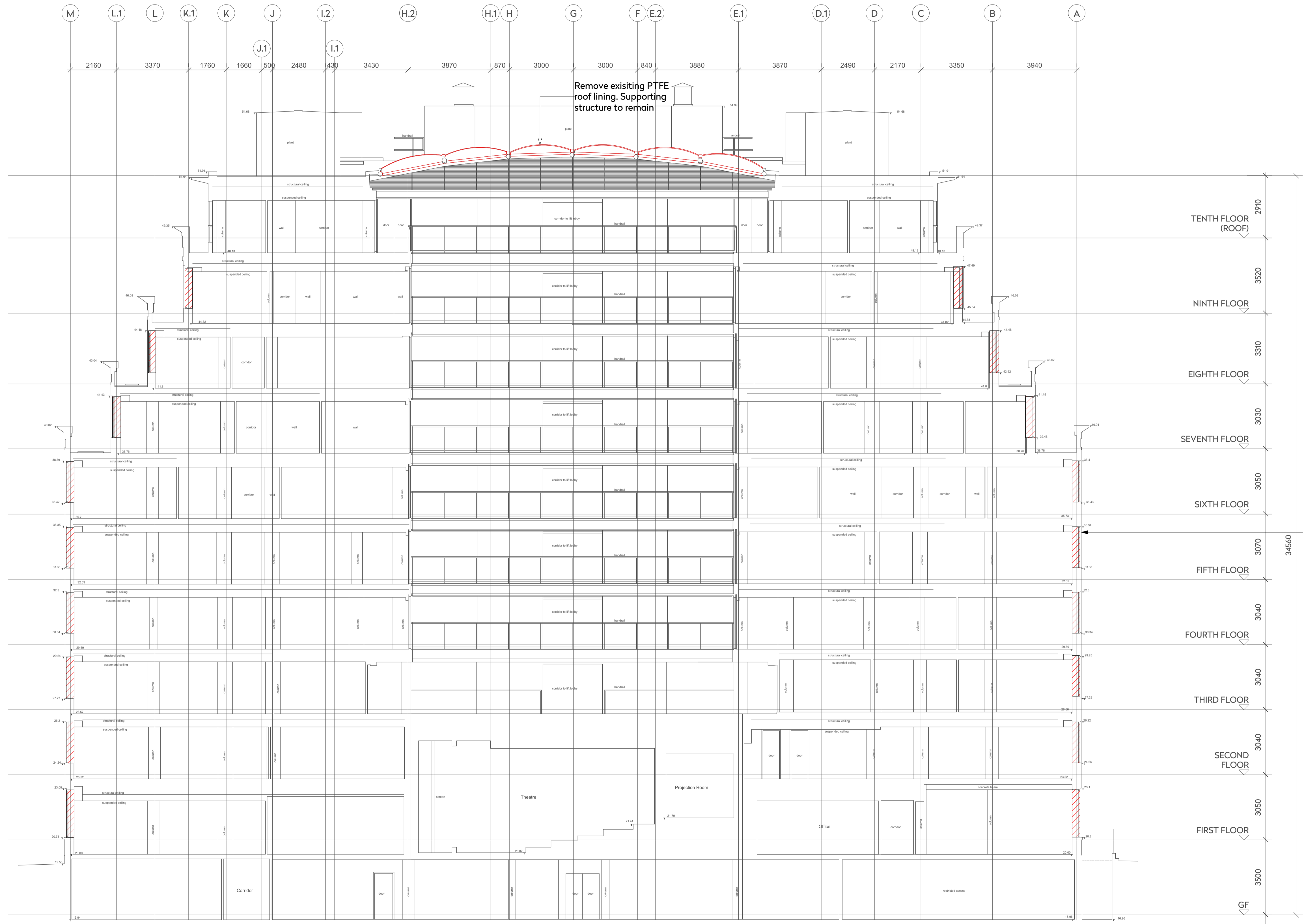
01 Existing Section A-A 1:100@A1