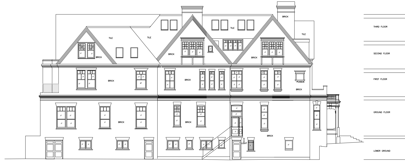
2 PROPOSED SOUTH ELEVATION D-D 1 : 100