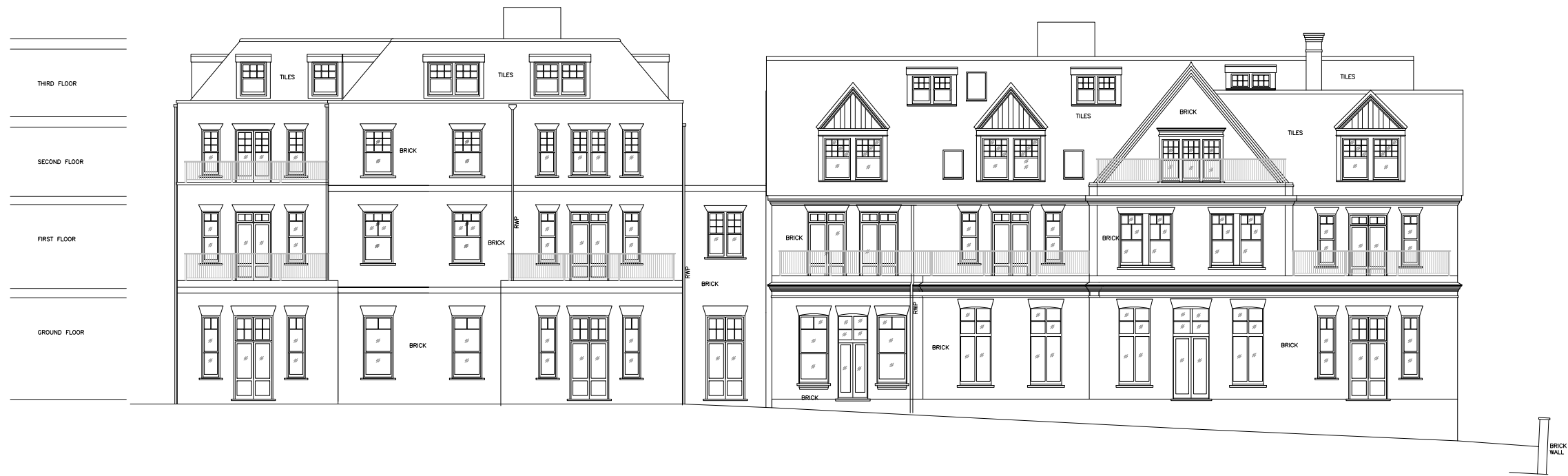
1 PROPOSED WEST ELEVATION C-C 1 : 100