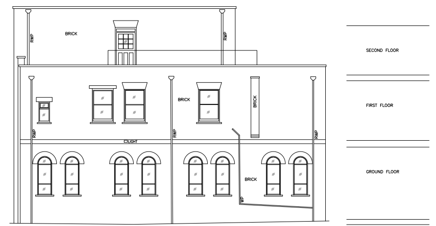
2 EXISTING NORTH ELEVATION B-B 1 : 100