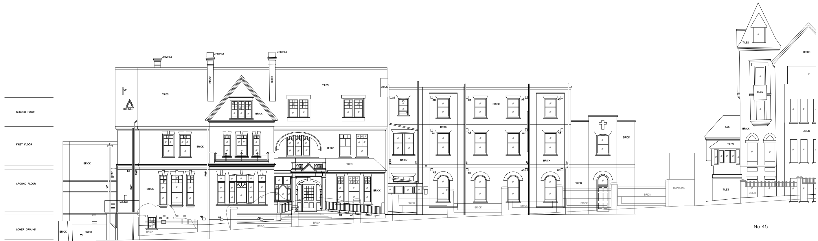
1 EXISTING EAST ELEVATION A-A 1 : 100