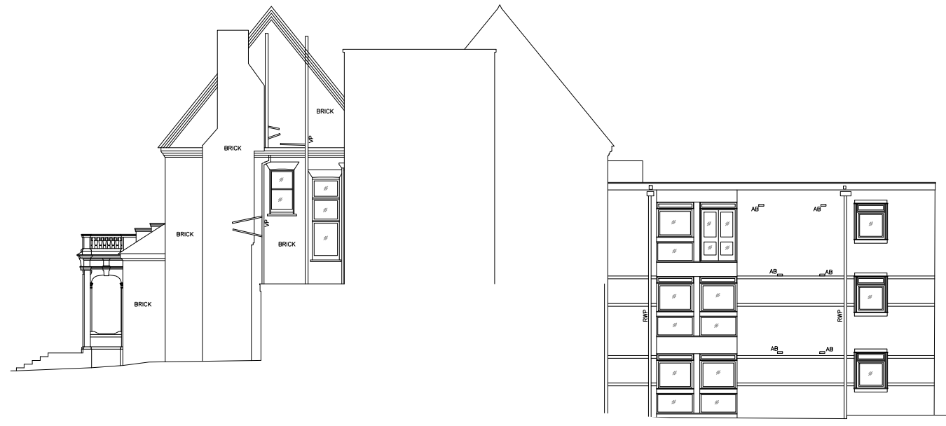
3 EXISTING INSET NORTH ELEVATION E-E 1 : 100