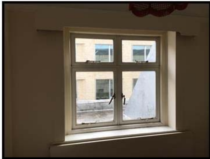
3: Typical form of dormer windows W3-W12