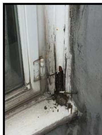
5: As (4)