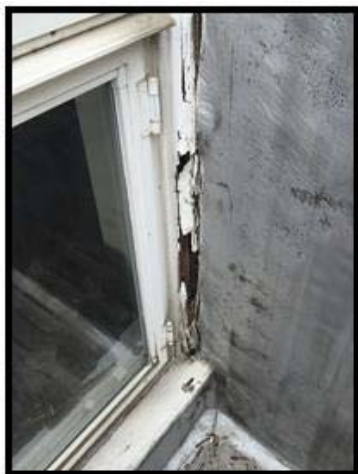
4: Condition of timber subframes