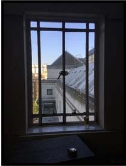
1: Existing window W2