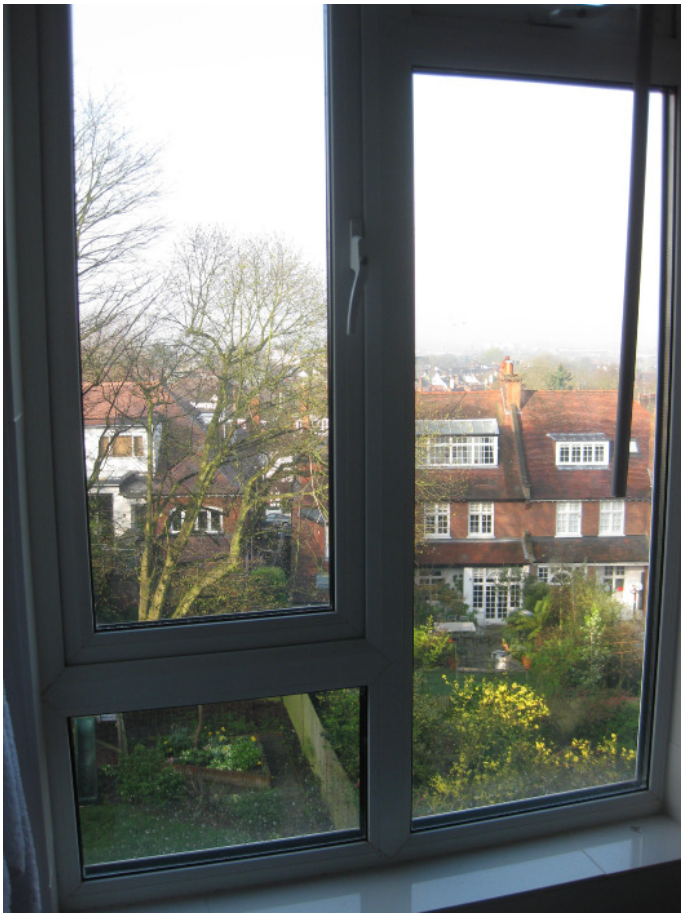
Above : view out of second floor bathroom Below : view of second floor landing with bathroom ahead

Views of the stairwell and window at second floor, view out of the stair window and view of the second floor bathroom and it's rear window.