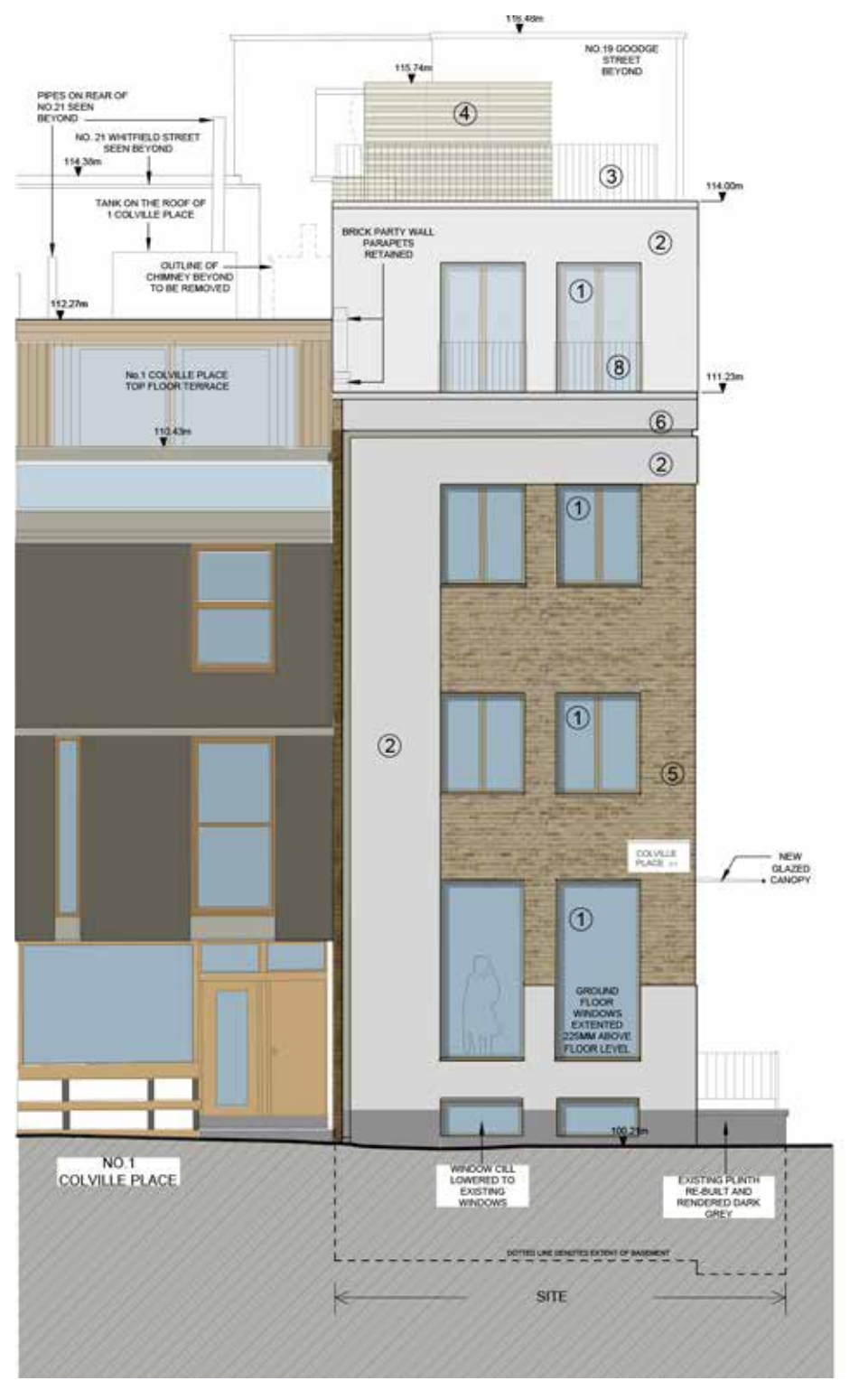
Consented Colville Place Elevation