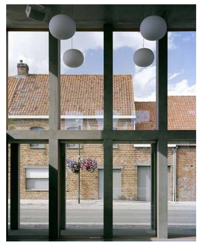
The two images above are of the Merkem community centre by Rapp & Rapp