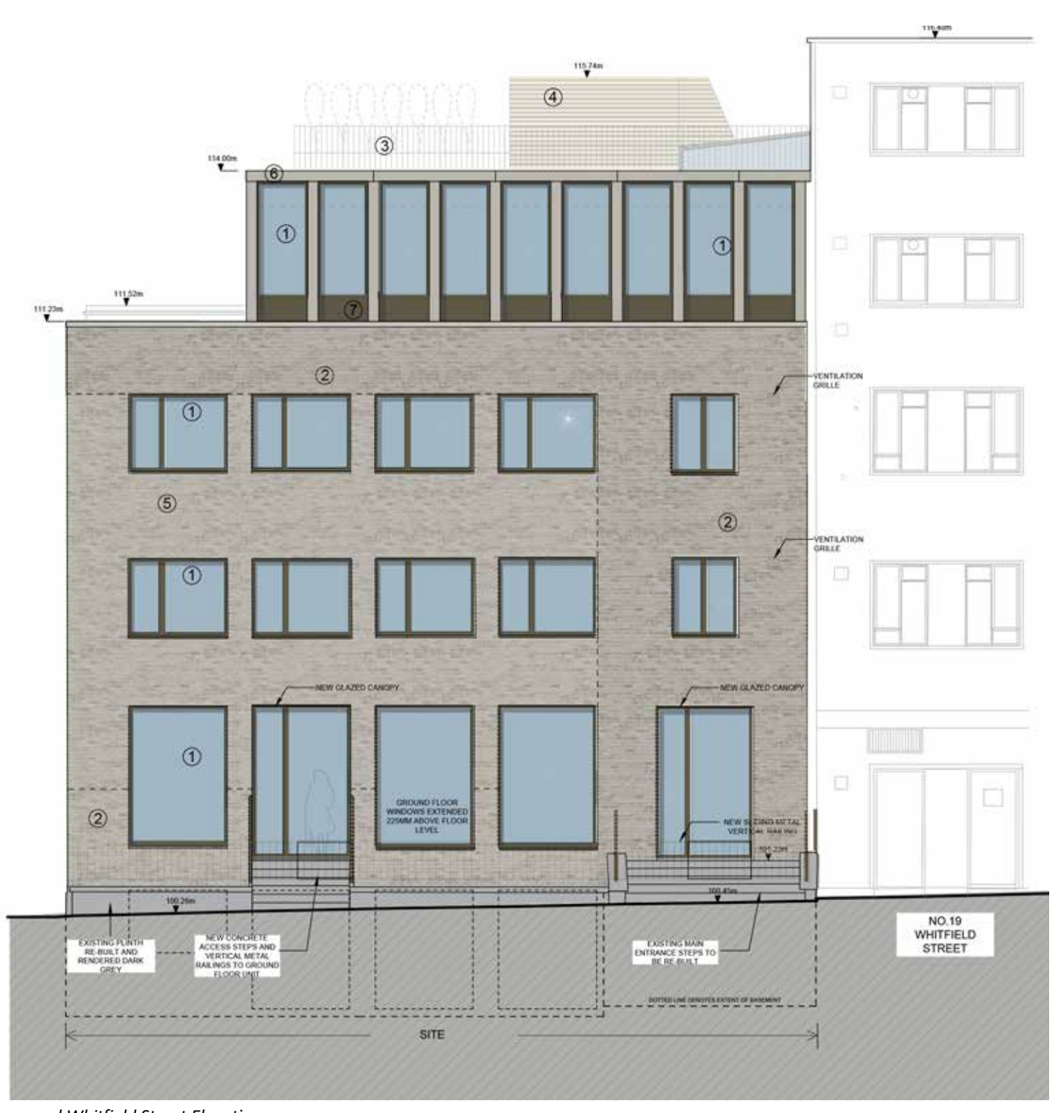
Proposed Whitfield Street Elevation