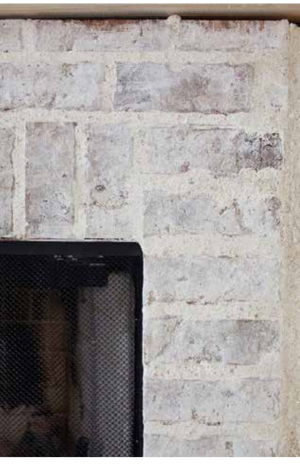
Mortar washed brickwall

Museum Of Modern Literature in Germany by David Chipperfield.