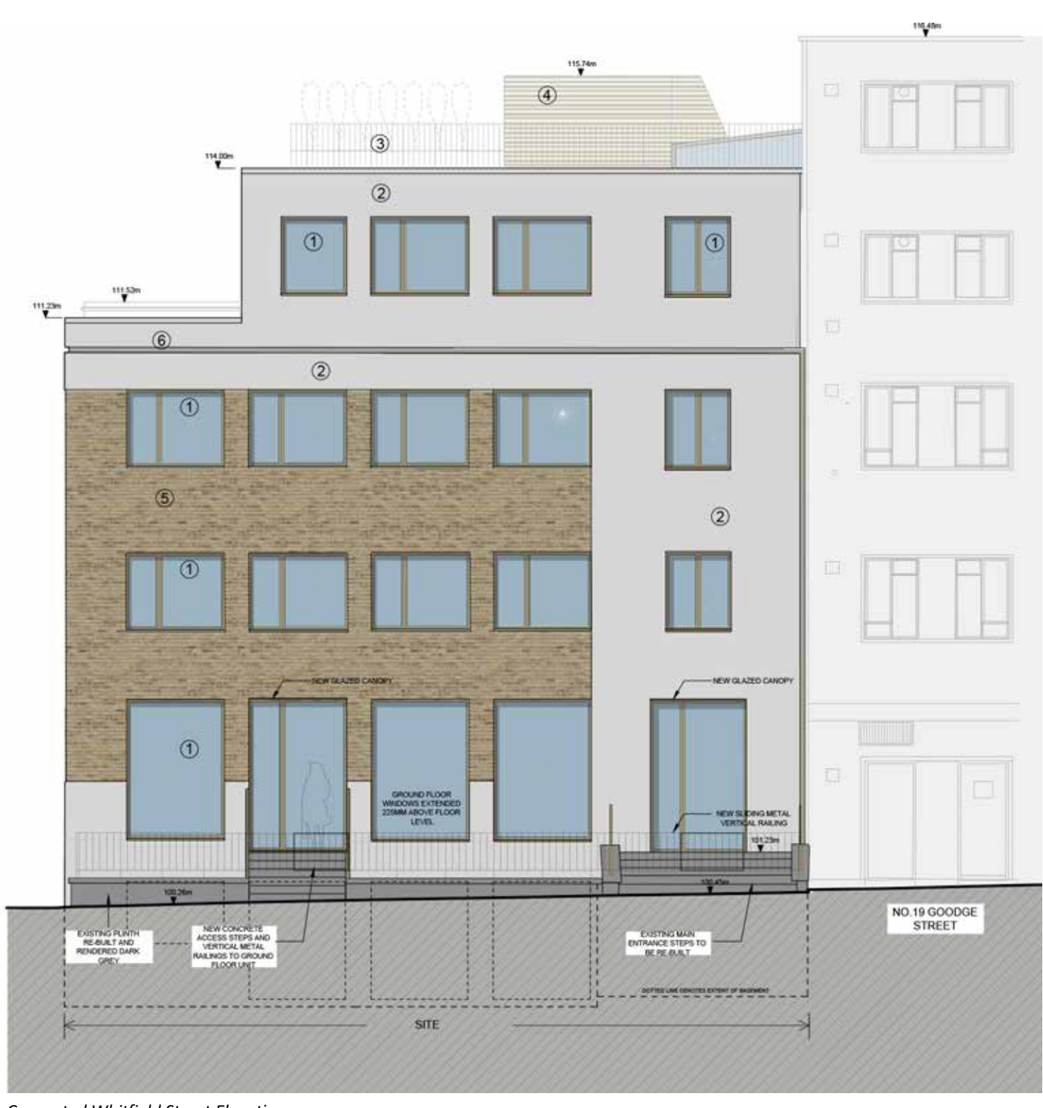
Consented Whitfield Street Elevation