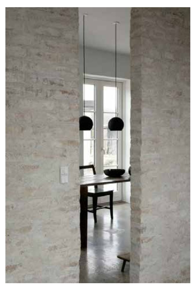
Humblebaek House by Norm Architects