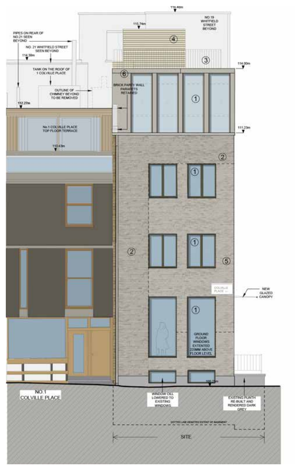
Proposed Colville Place Elevation