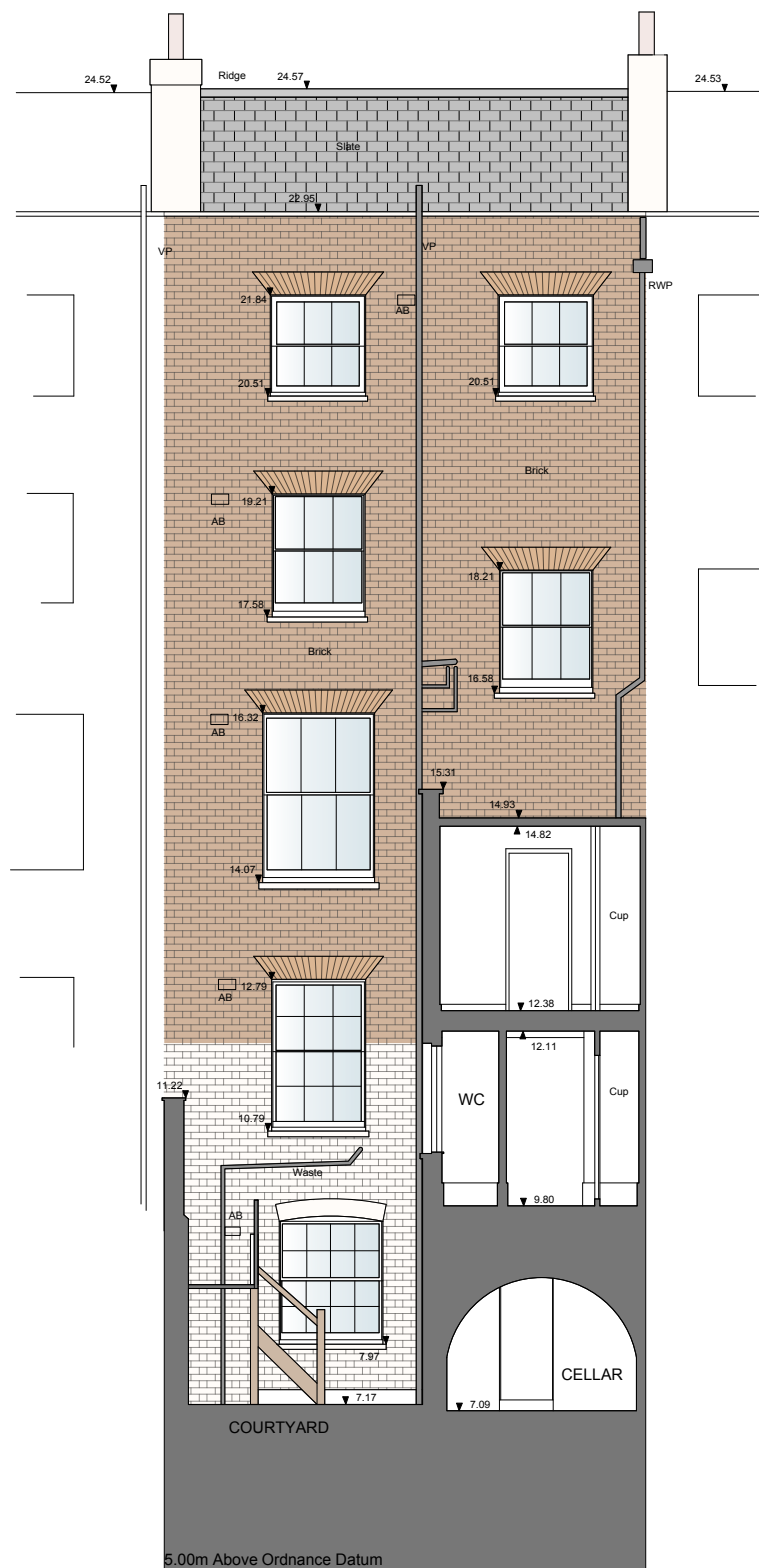
COURTYARD REAR ELEVATION