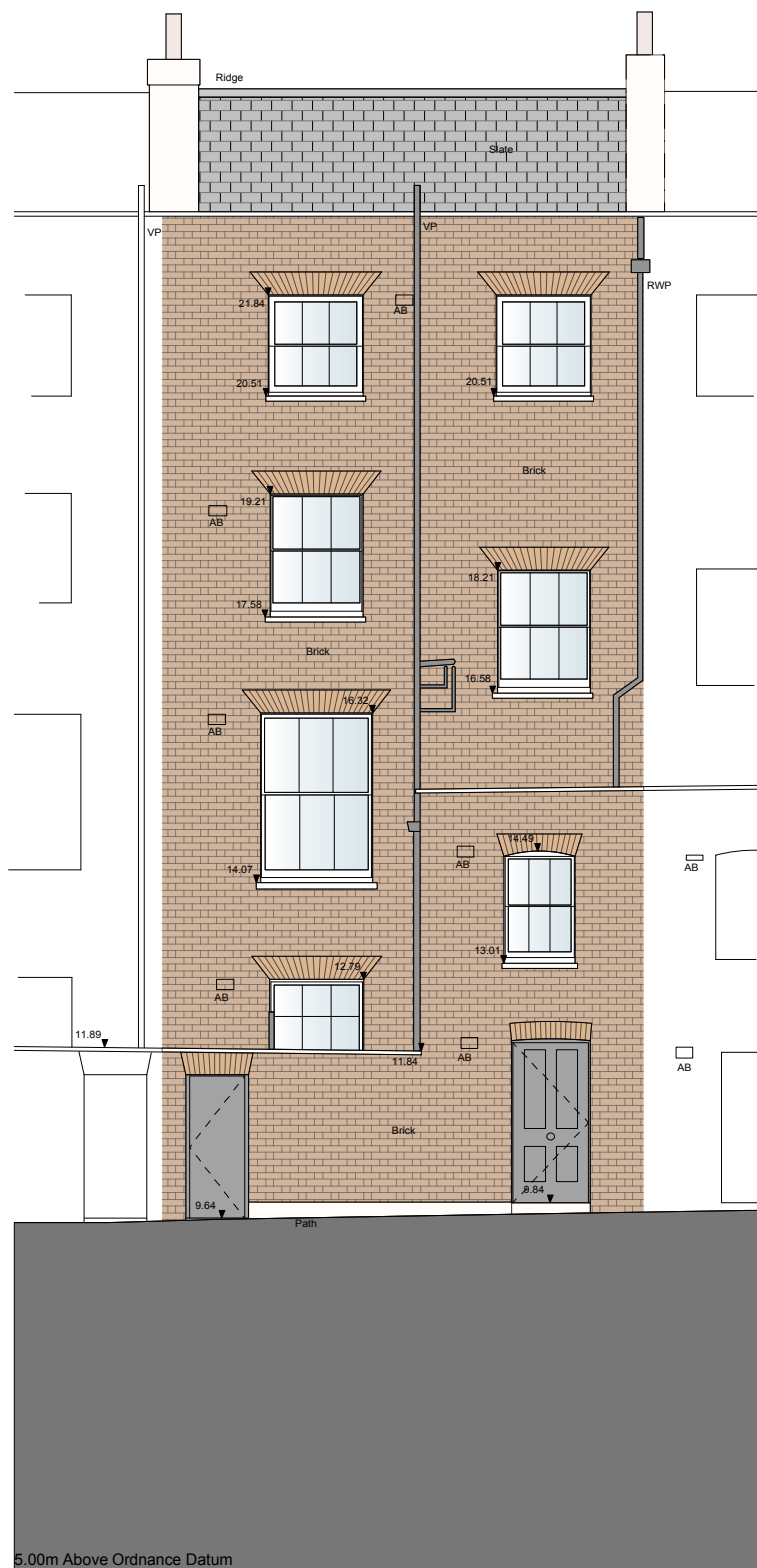
STREET REAR ELEVATION