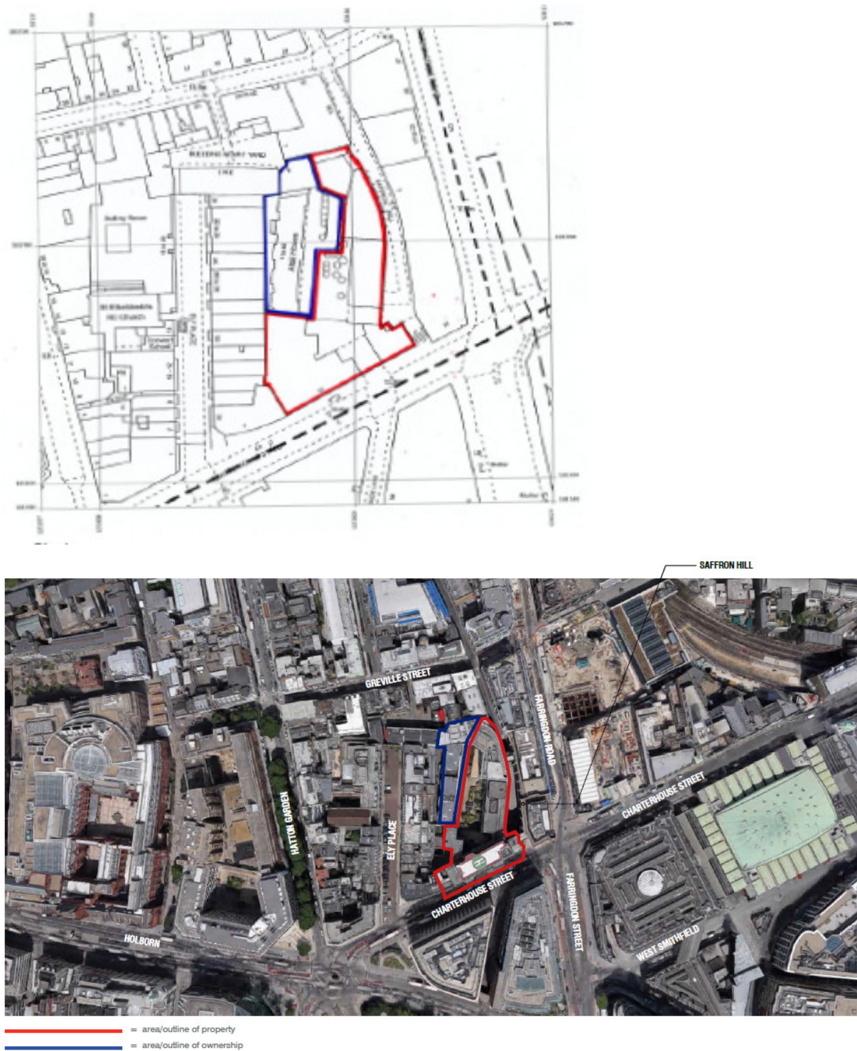
Figure 1.1: Proposed Development Site Location