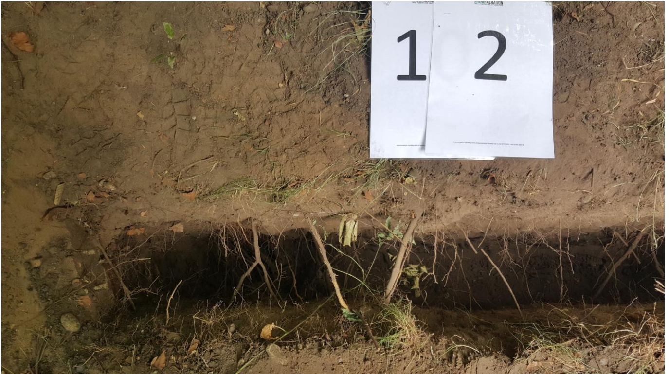
Trial Pit 12