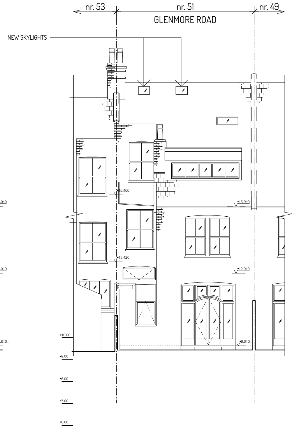
PROPOSED - REAR ELEVATION