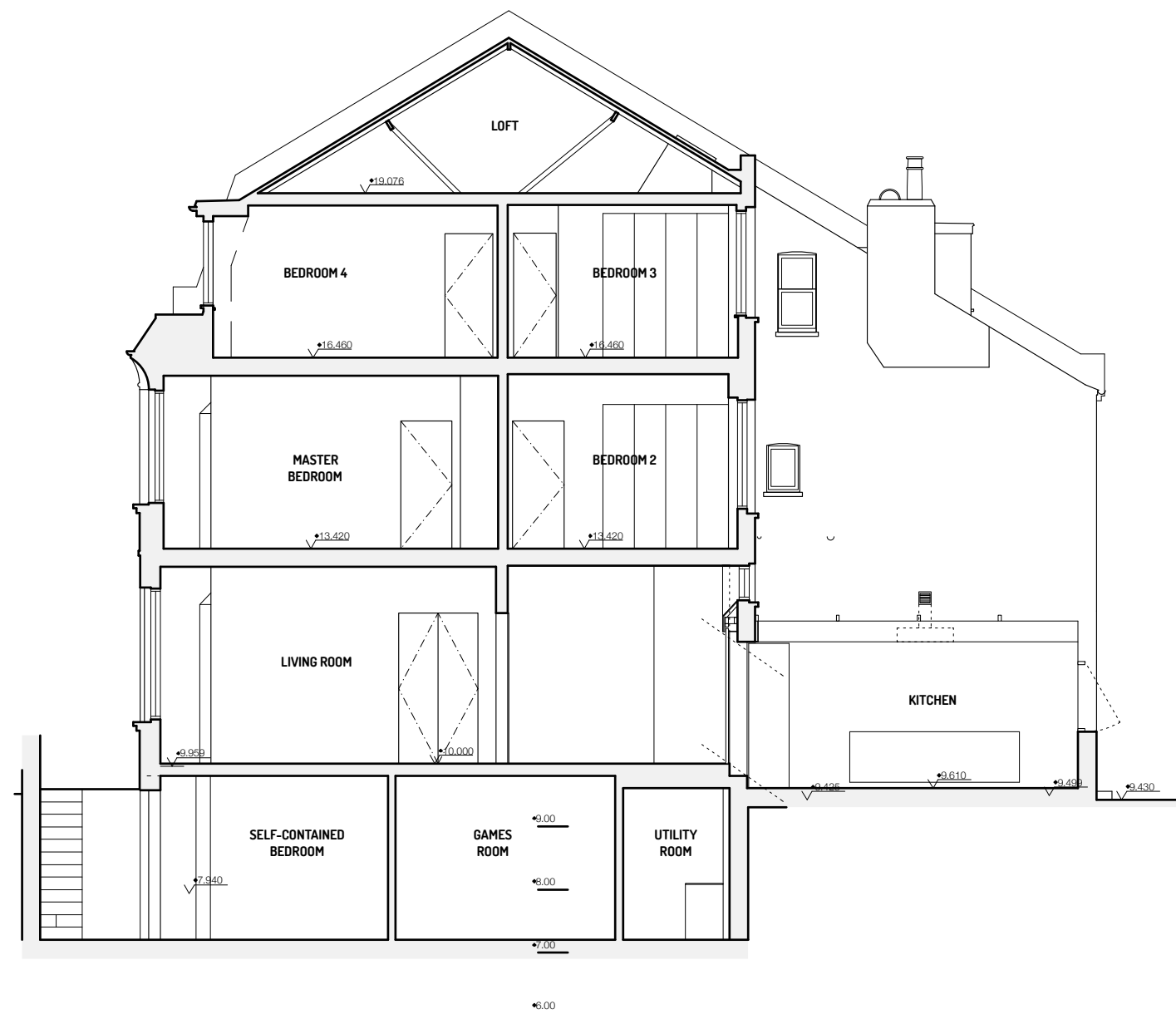
EXISTING - SECTION B - B