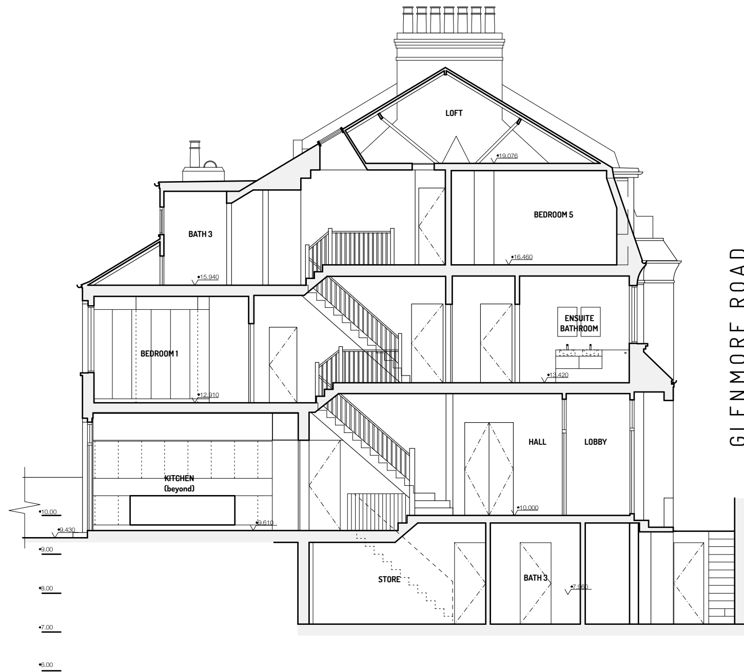
EXISTING - SECTION A - A