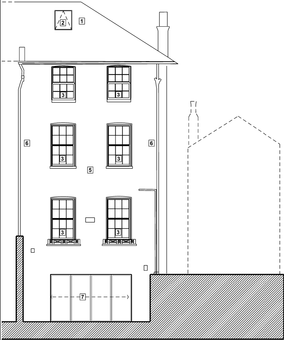
EH104 001 REAR ELEVATION PROPOSED