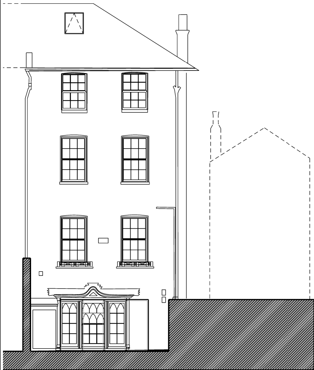
EH005 REAR ELEVATION 001 EXISTING

NOTES: This drawing has been produced solely for the client and project listed below and is submitted as part of planning application and is not intended for use by any other person or any other purpose. The location and size of existing features are indicative only. The design is copy right of Fossey Arora Limited. The drawing may not be produced in part or in whole without prior permission