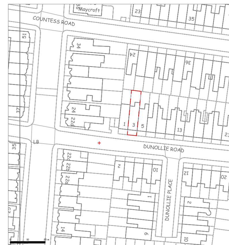
LOCATION PLAN 1/1250