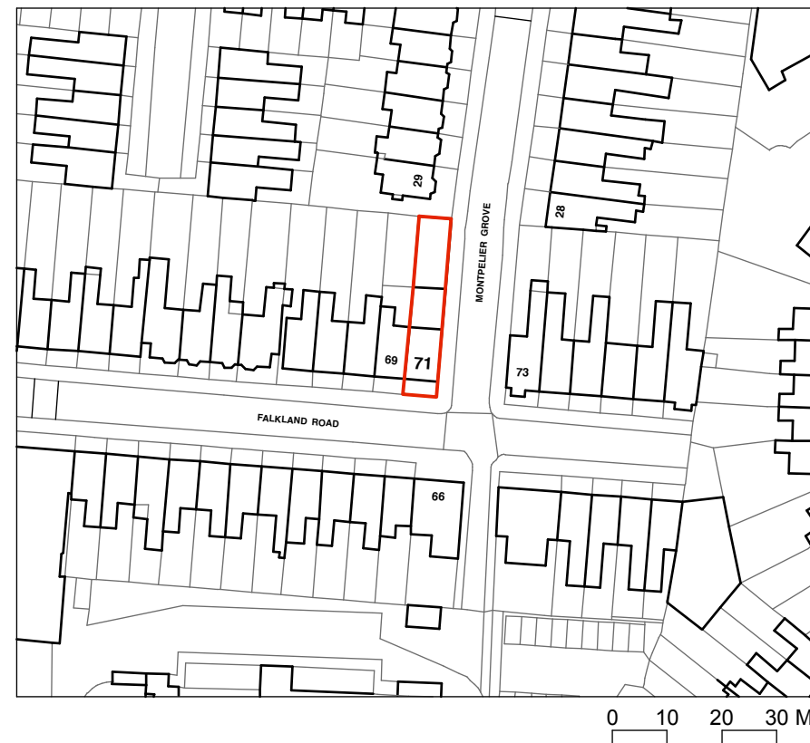
SITE LOCATION PLAN scale 1:1250

Site within red boundary: no. 71 Falkland Road, NW5 2XB