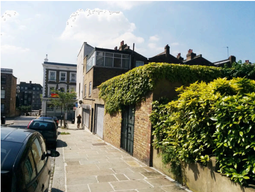
PH3 - Rear & side view of no. 71 Falkland Road from Montpelier Grove.