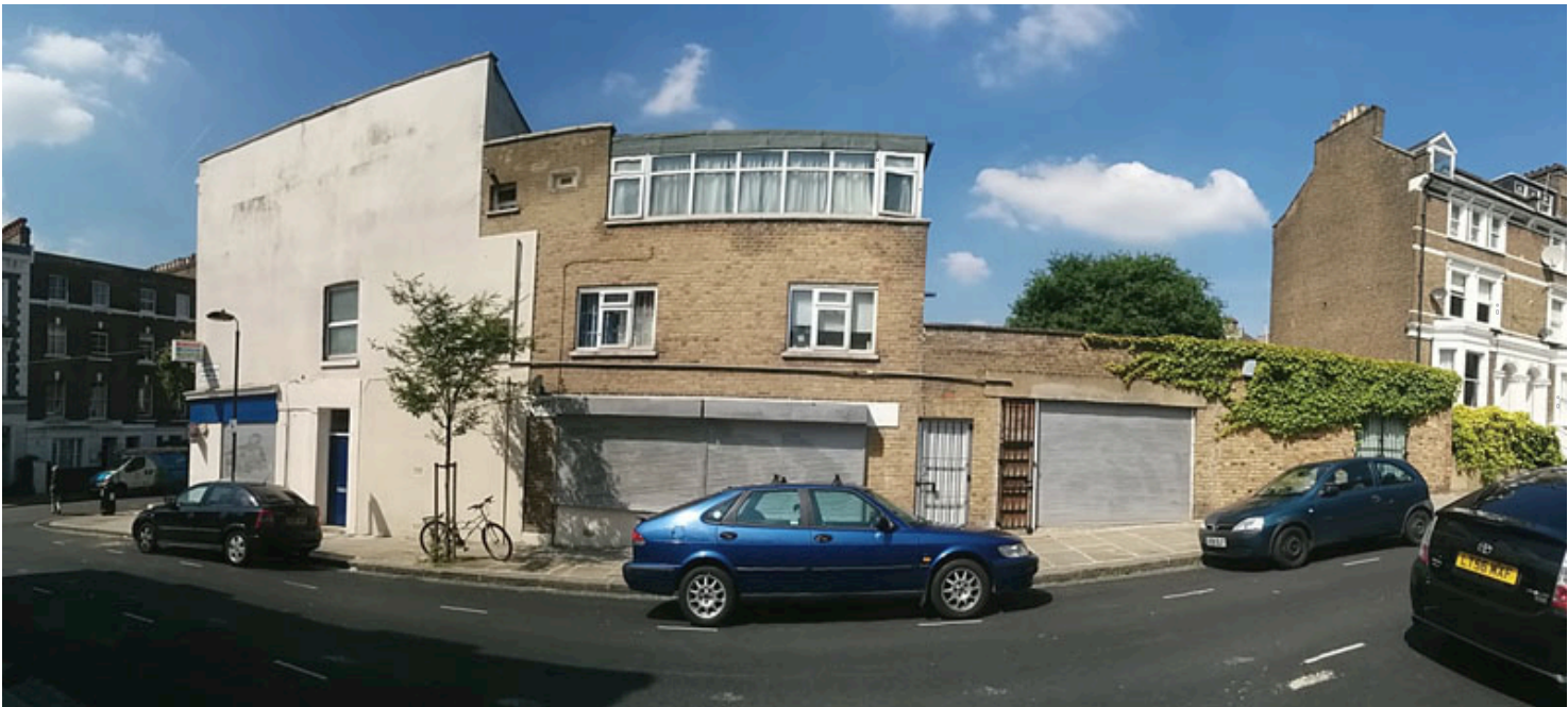
PH4 - Panoramic view of no. 71 Falkland Road from Montpelier Grove.