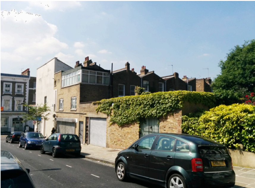
PH1 - View of no. 71 Falkland Road from Montpelier Grove.