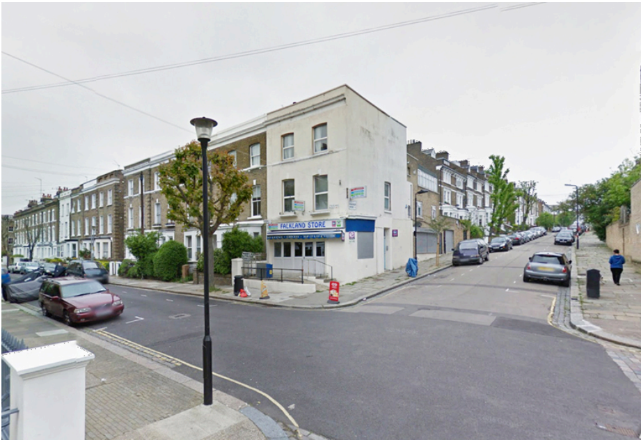
PH2 - Front and side view of no. 71 Falkland Road.