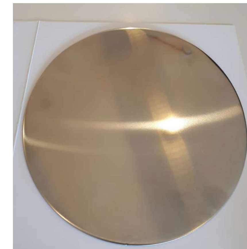
Mirror-polished Stainless Steel Finish Sample