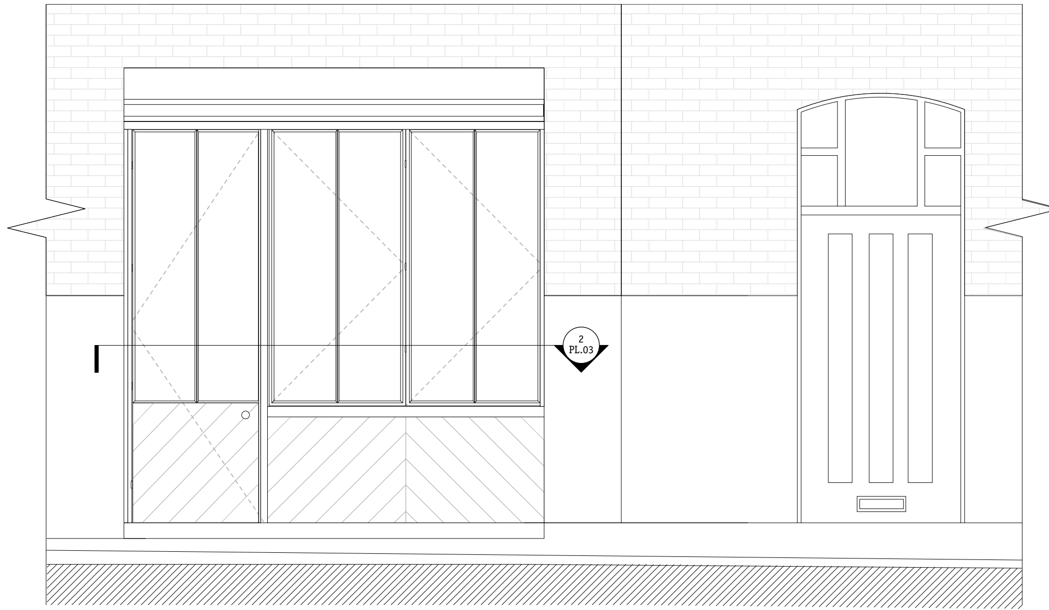
1 Proposed Shop Front Elevation 1:25@A3