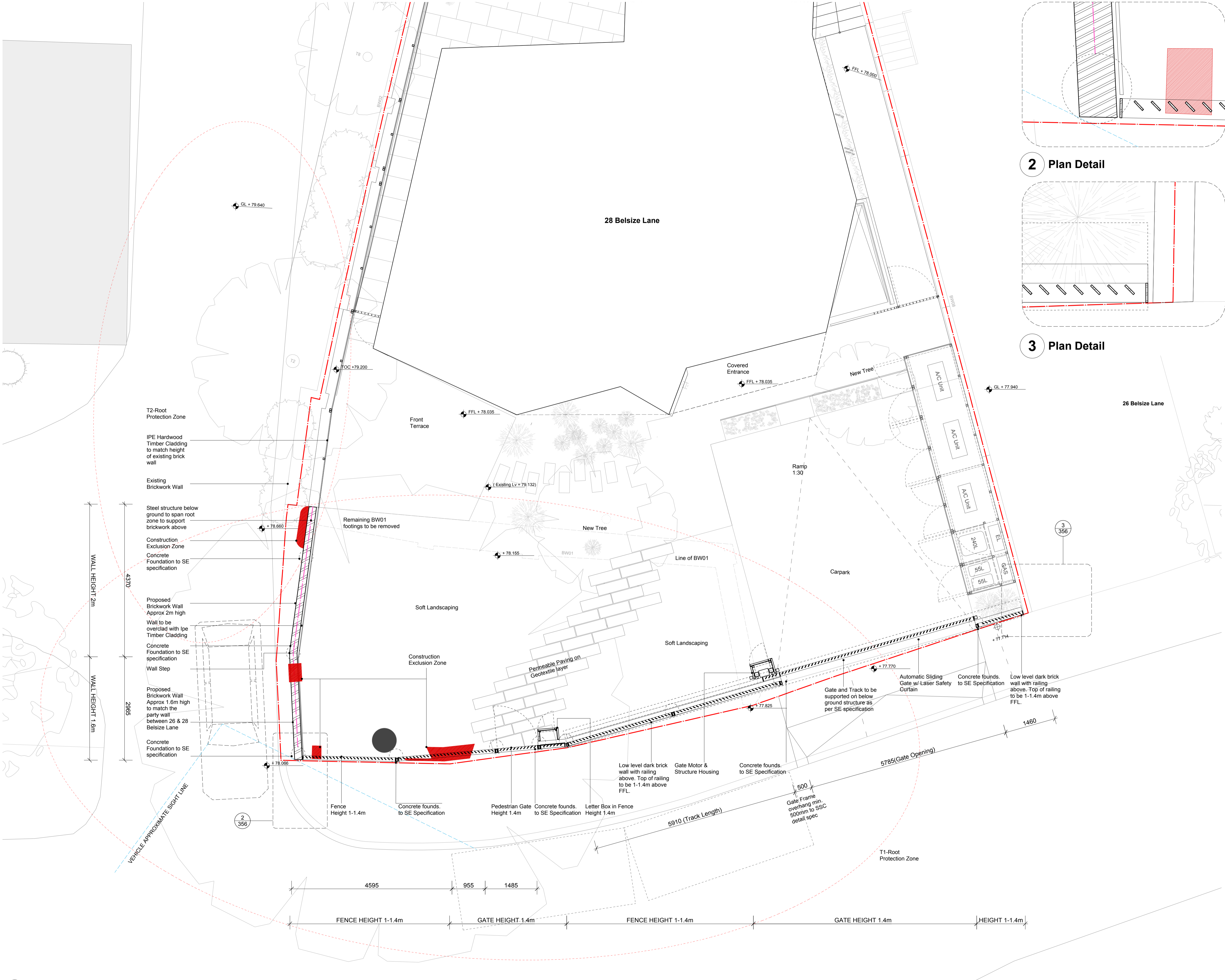
2 Plan Detail