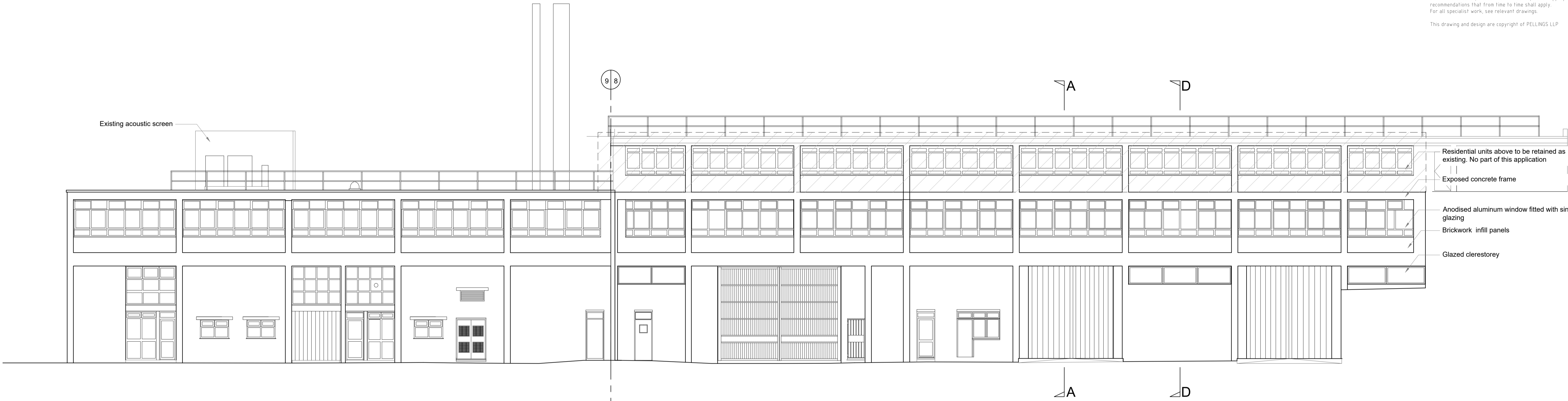
1 - Existing E9: internal north-east elevation SCALE 1:100 @ A1

NOTES: Report all discrepancies, errors and omissions Do not scale from this drawing Verify all dimensions on site before commencing any work or preparing shop drawings All materials, components and workmanship are to comply with all the relevant British Standards, Codes of Practice, and appropriate manufacturers recommendations that from time to time shall apply. For all specialist work, see relevant drawings. This drawing and design are copyright of PELLINGS LLP