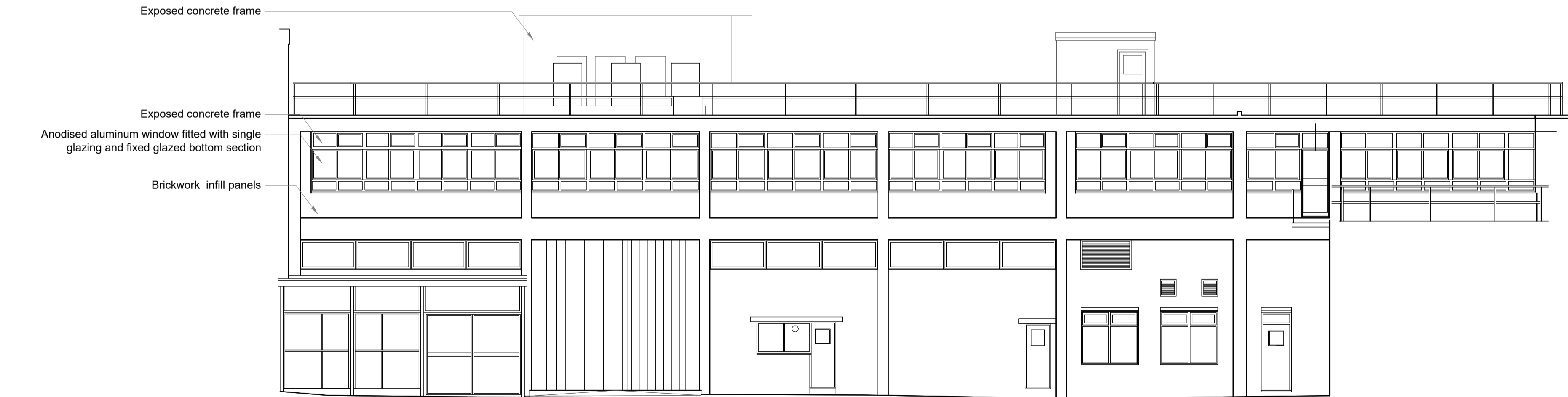
3 - Existing E7: internal west elevation SCALE 1:100 @ A1