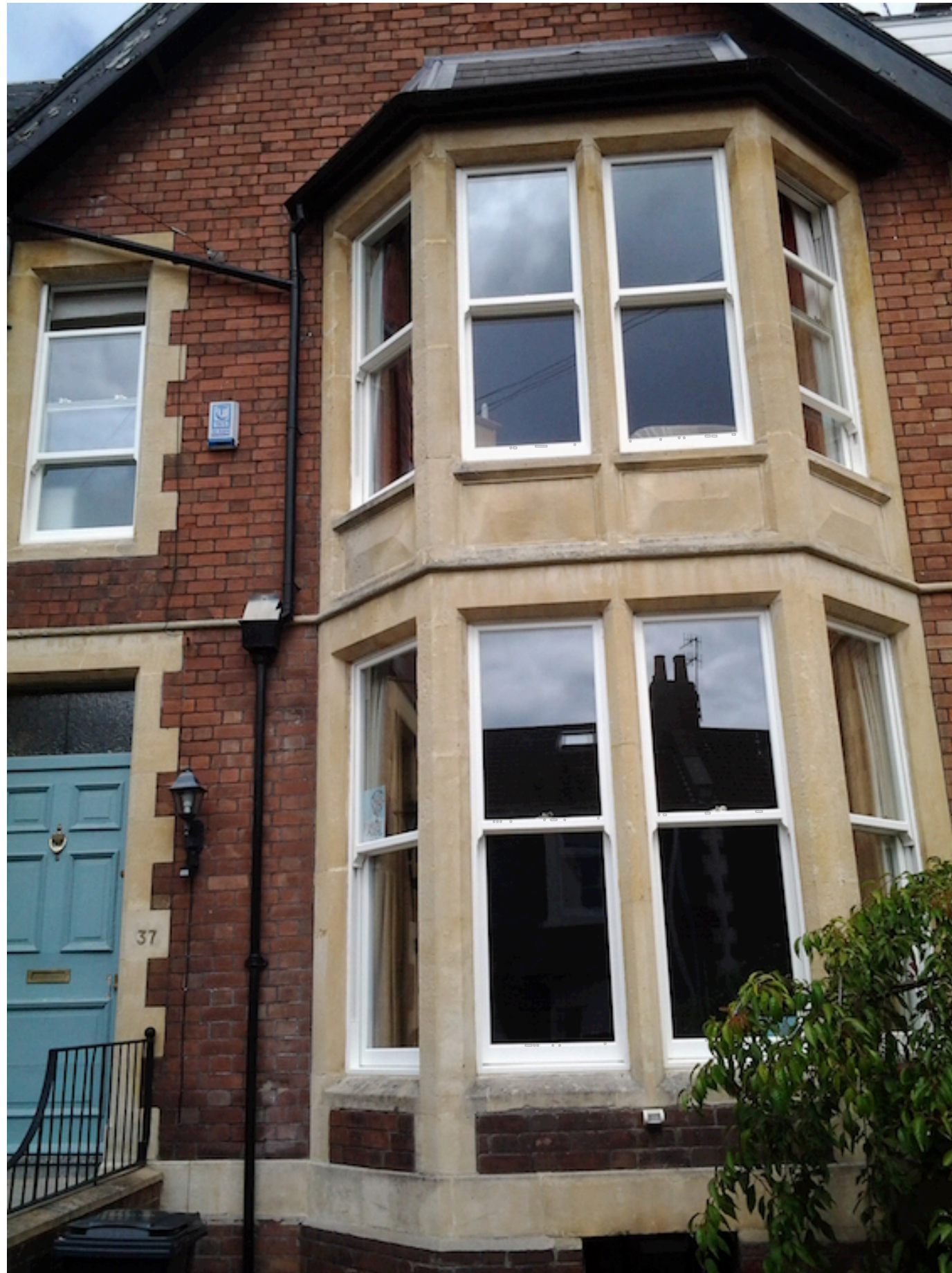
Photo of Typical Proposed Replacement Windows