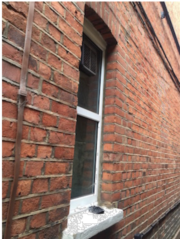
Window 8 (false window to remain)