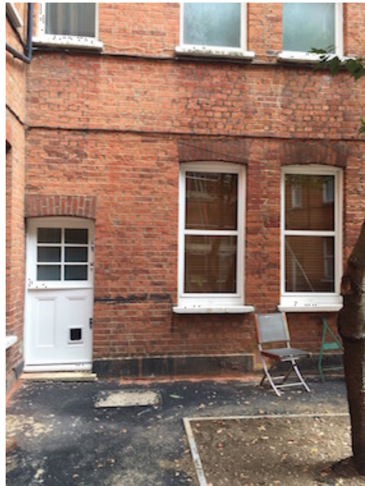
Window 5 Window 6