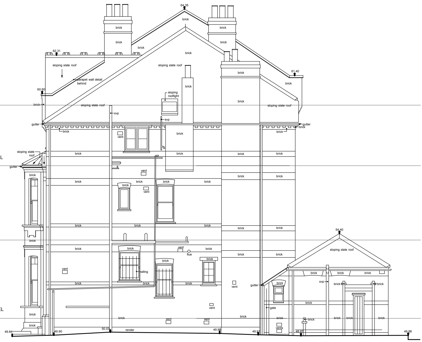
2 EXISTING SIDE ELEVATION 1:100