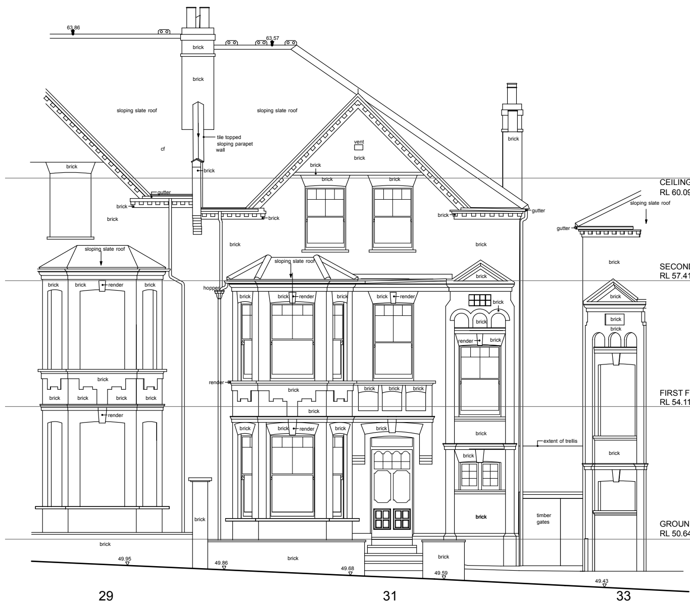
1 EXISTING FRONT ELEVATION 1:100